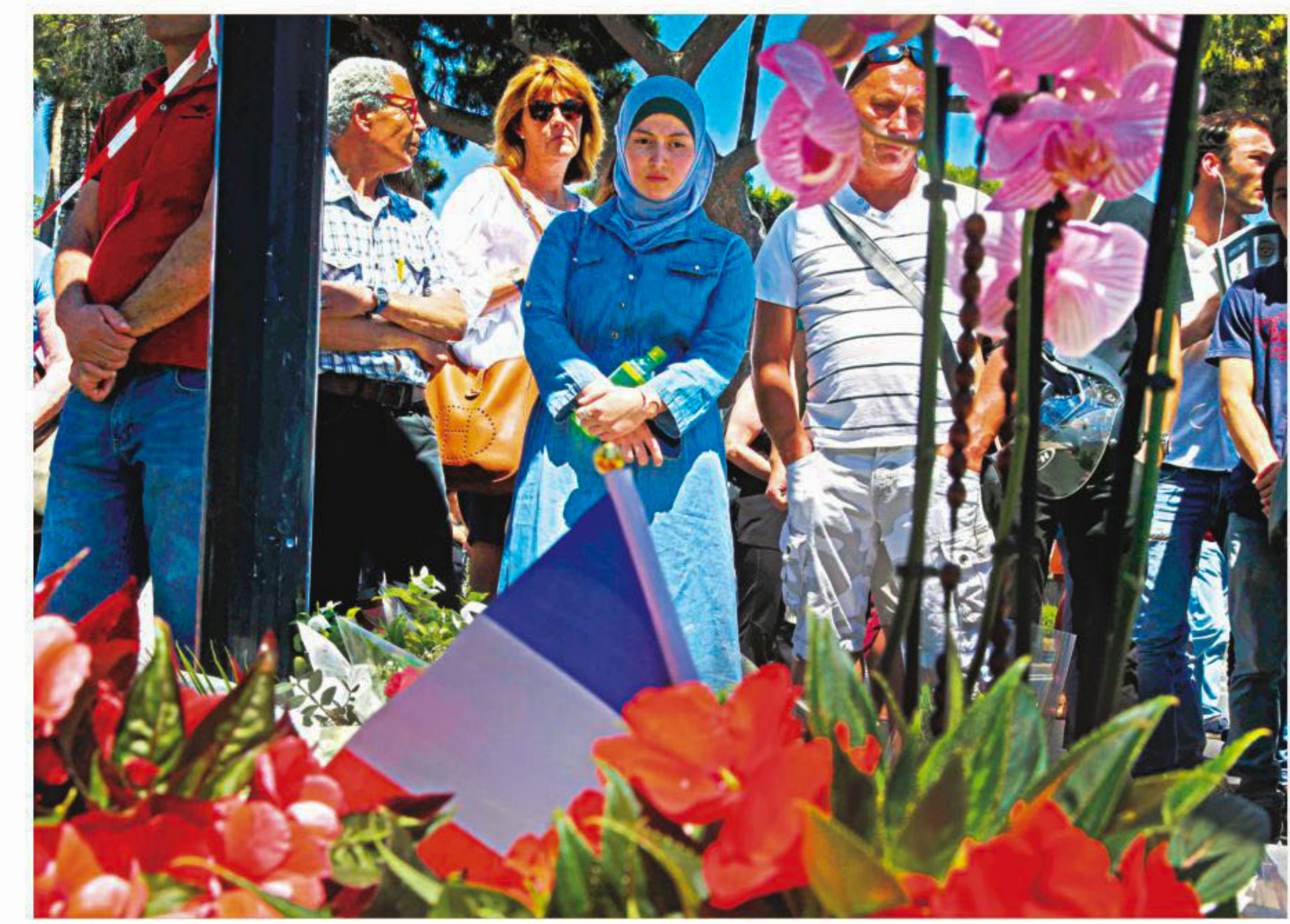
(From left, clockwise) People stand in silence near the massacre site yesterday to remember the victims of the Bastille Day truck attack in Nice; a man sits next to a body; and shocked people comfort each other after the Thursday's attack. A Tunisian-born man zigzagged a truck through a crowd celebrating Bastille Day in the French city of Nice, killing at least 84 and injuring dozens including children which President Francois Hollande termed as a "terrorist" attack.

AFP, Moscow Top US diplomat John Kerry stressed the urgency of closer co-operation in Syria after the Kremlin said yesterday a US proposal for direct military cooperation in the war-torn country had not been addressed in earlier talks with President Vladimir Putin. On the second and final day of his visit to Moscow, Kerry called for stepping up cooperation between the US and Russia to thwart jihadist groups. According to a leaked document seen by the Washington Post, Kerry's key proposal is to offer Russia closer US military cooperation against the al-Nusra Front jihadist group. In exchange, Moscow would be required to pressure its ally Assad to ground his own jets and end attacks on civilians and the moderate opposition.