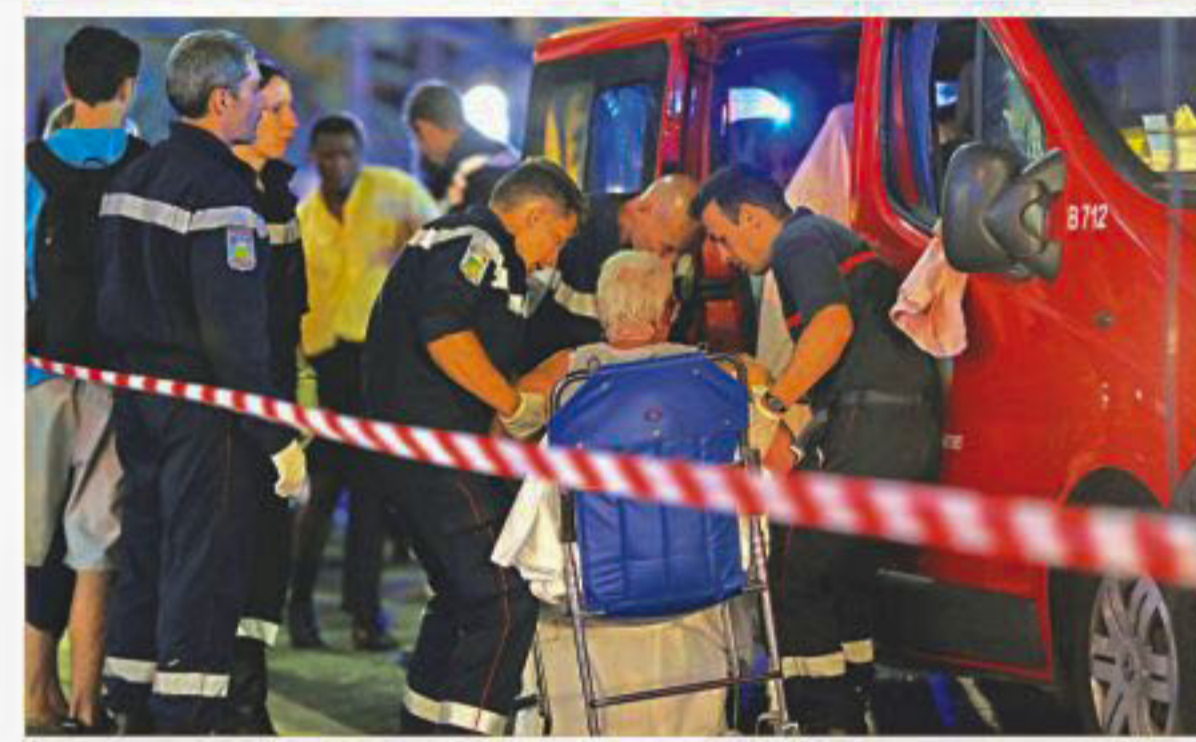
Top, police forces and forensic officers stand next to a truck that ran into a crowd celebrating the Bastille Day in the French city of Nice, killing at least 84 people. After the incident, bodies are seen, bottom left, on the ground, and bottom right, rescue workers help an injured woman to get in an ambulance.