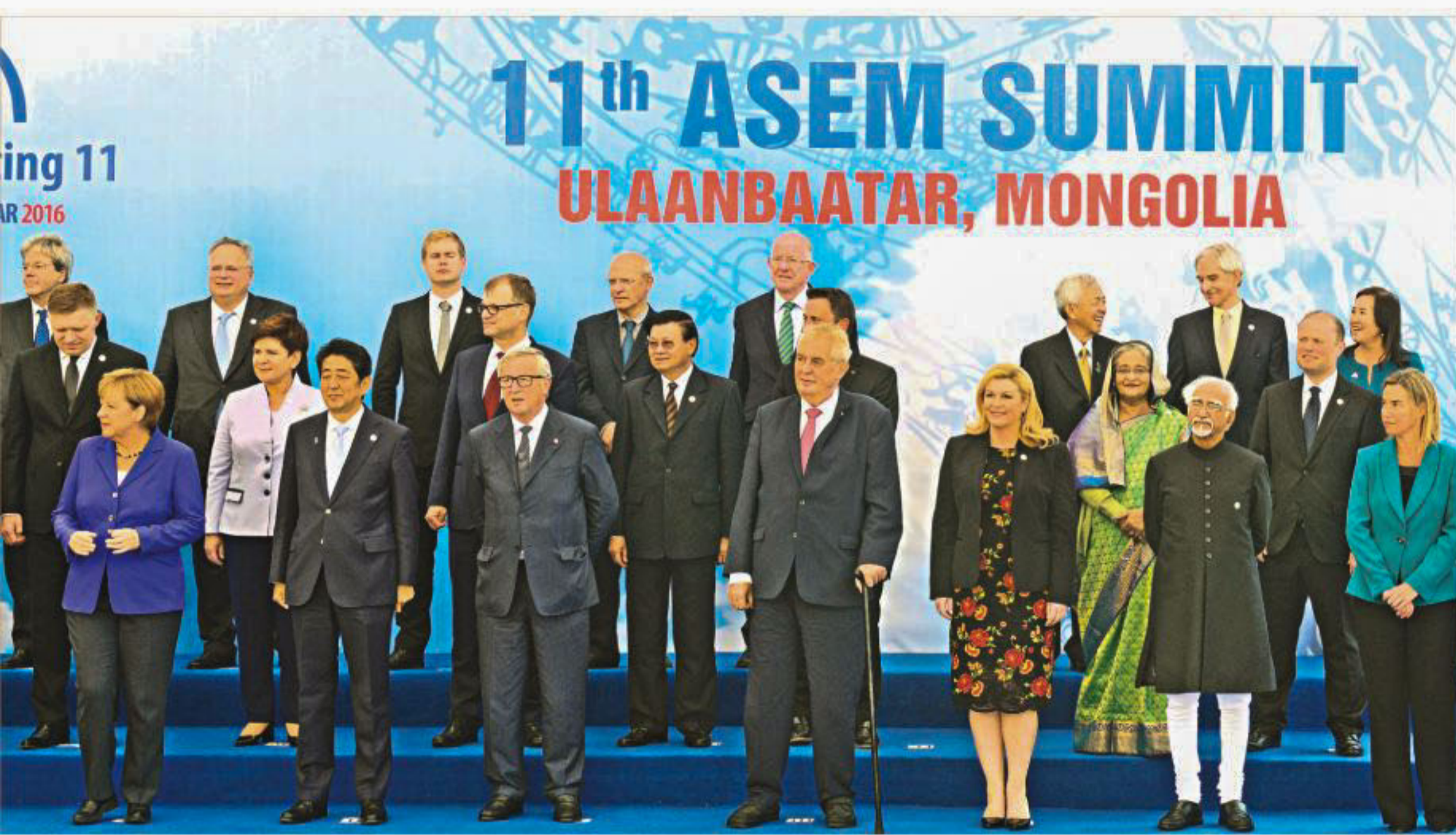
Prime Minister Sheikh Hasina and other world leaders pose for a photo during the 11th Asia-Europe Meeting (Asem) in the Mongolian capital of Ulaanbaatar yesterday.

Hasina tells Japanese PM; Asia-Europe Summit begins in Ulaanbaatar