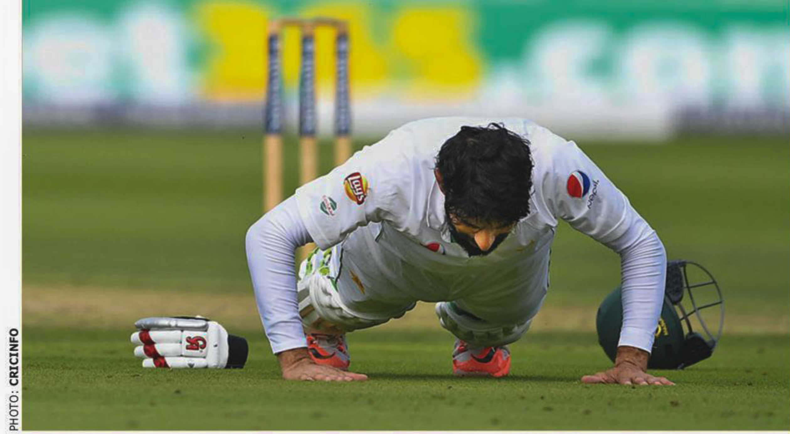
Pakistan captain Misbahul Haq marks his hundred on Lord's debut with a set of push-ups on the opening day of the first Test against England yesterday.