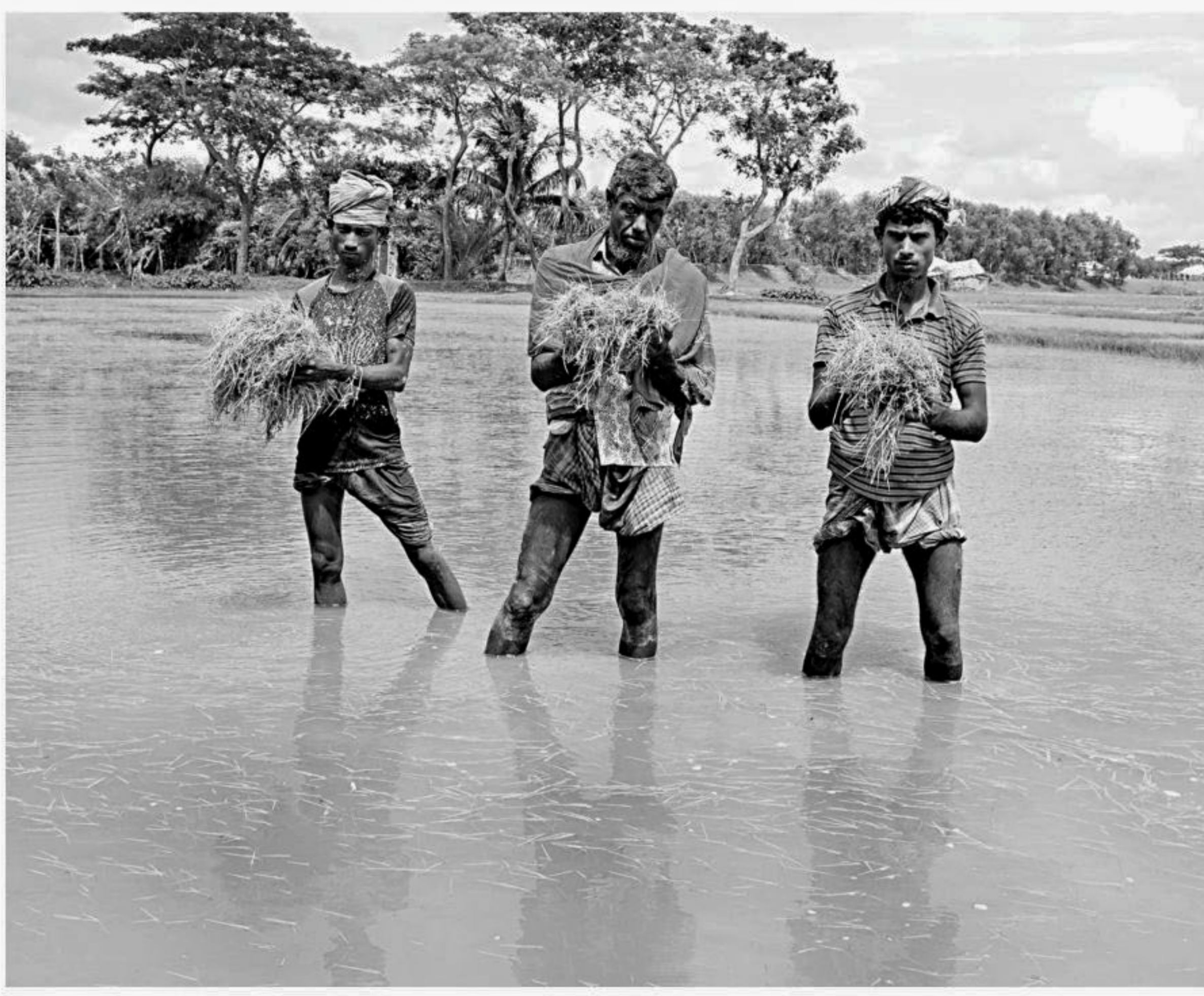
Three farmers show damaged seedlings from their field at Charmarshon in Rangabali upazila under Patuakhali district.