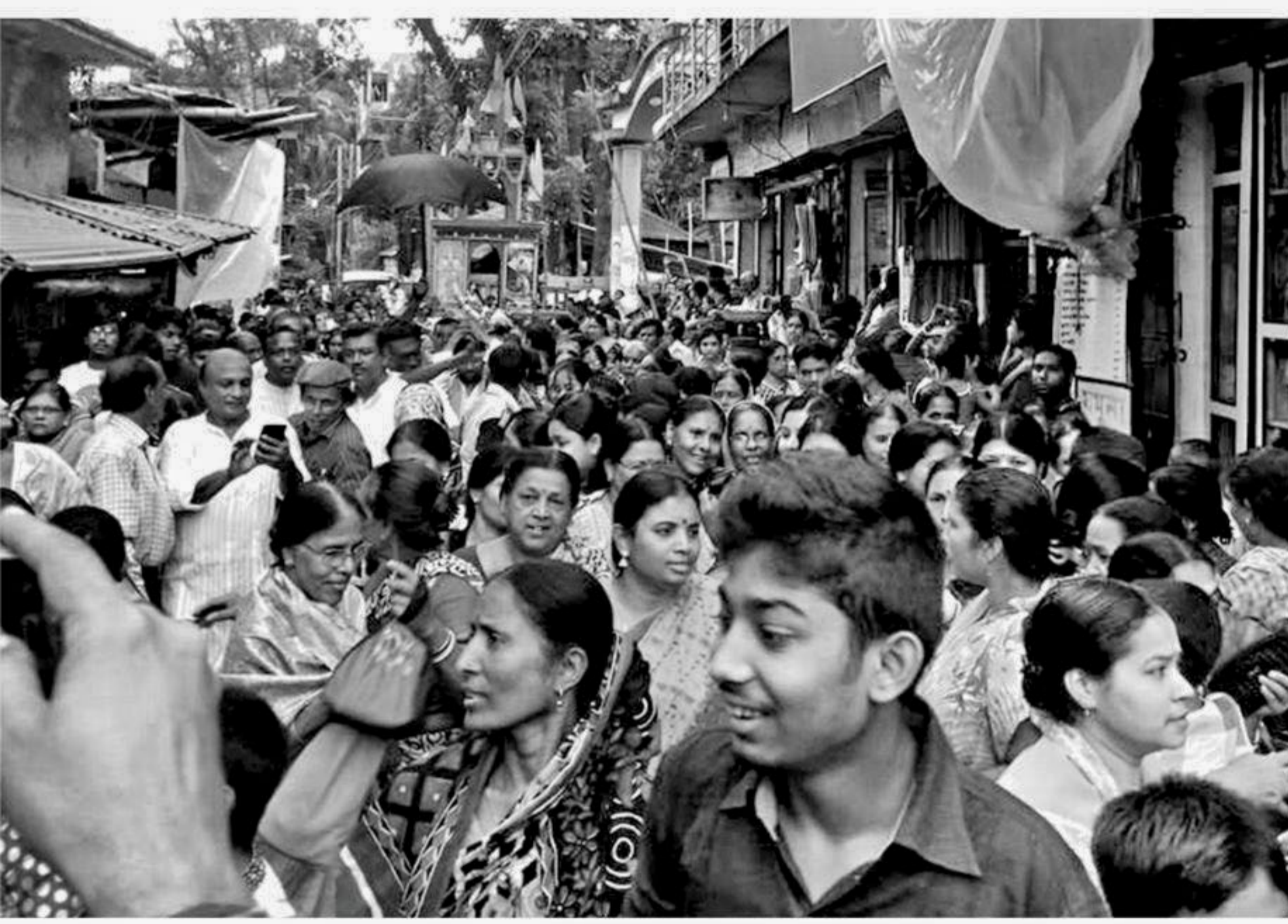
Hindu devotees take part in traditional religious festival Ulto Rathjatra (return journey of chariot) of Sri Sri Jagannathdeb in Manikganj yesterday.