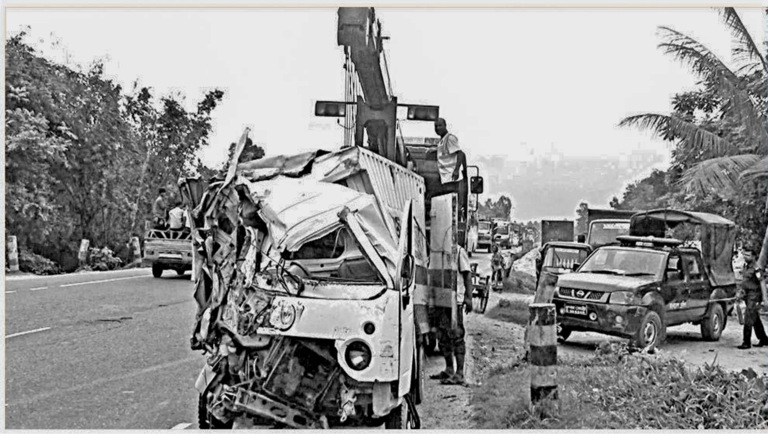
This Dhaka-bound covered van collided head on with a truck on the Dhaka-Tangail highway in Karatipara bypass area of Basail upazila in Tangail yesterday, leaving four people dead and eight others injured.

The Rajshahi City Corporation (RCC) and German Development Cooperation (GIZ) jointly organised the workshop titled "Slaughterhouse Cum Biogas Plant" at RCC conference hall in association with the Sustainable and Renewable Energy Development Authority ((SREDA).