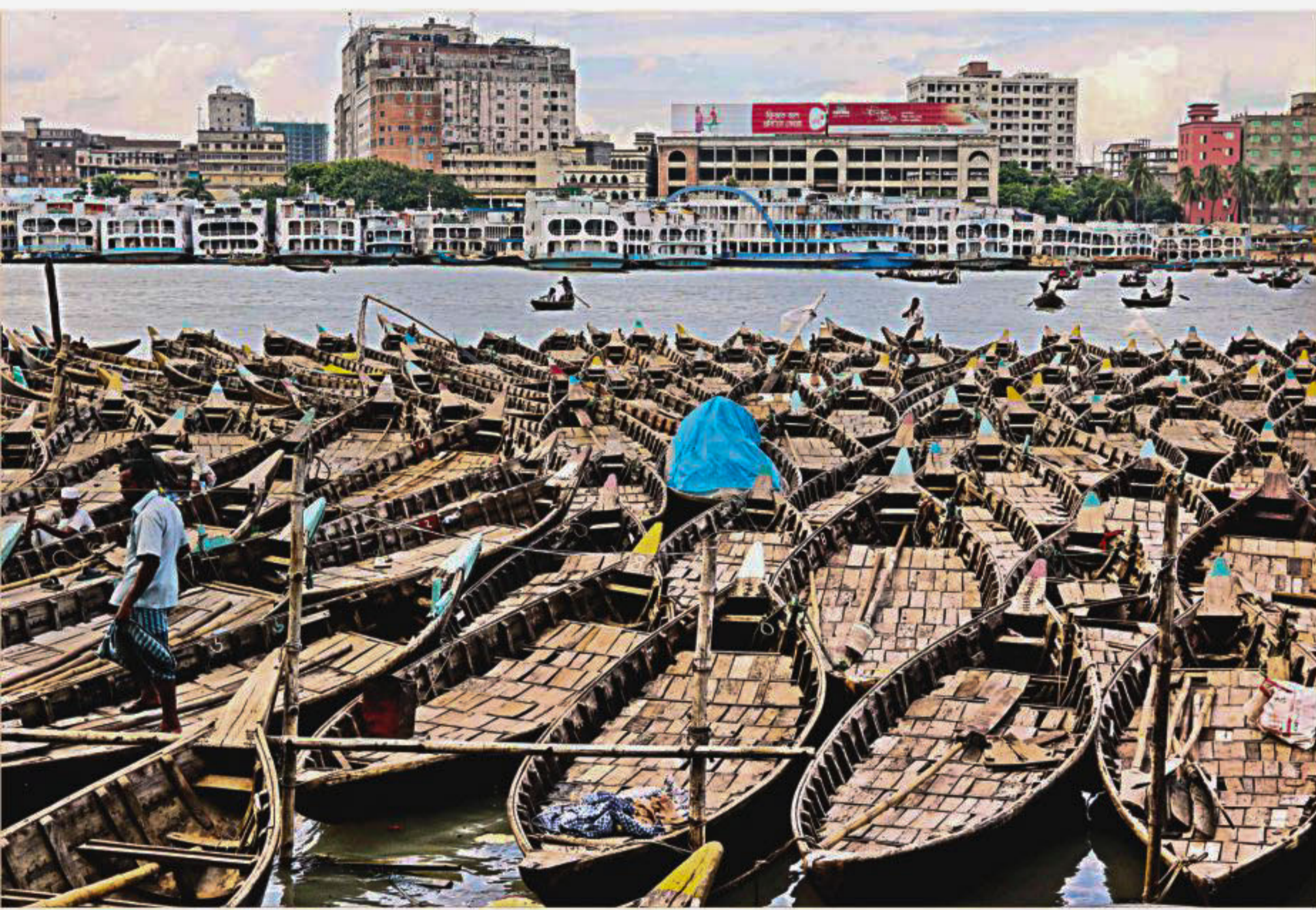
Dozens of boats lie idle in the Buriganga near Alam Market of Keraniganj on the outskirts of the capital yesterday as boatmen who ferry passengers across the river are yet to resume work after Eid.