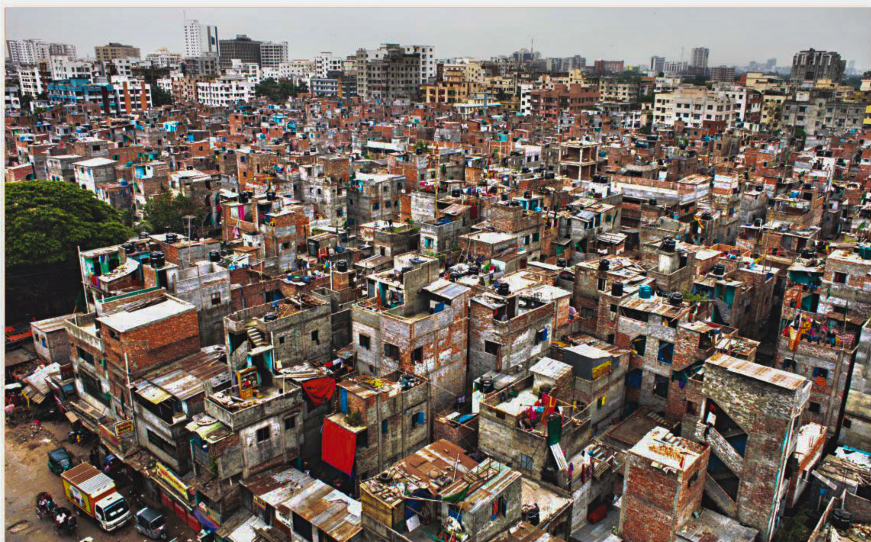
A major earthquake may cause massive destruction in the highly populated Dhaka city crammed with unplanned buildings like that seen in this picture taken at Mohammadpur Geneva Camp.