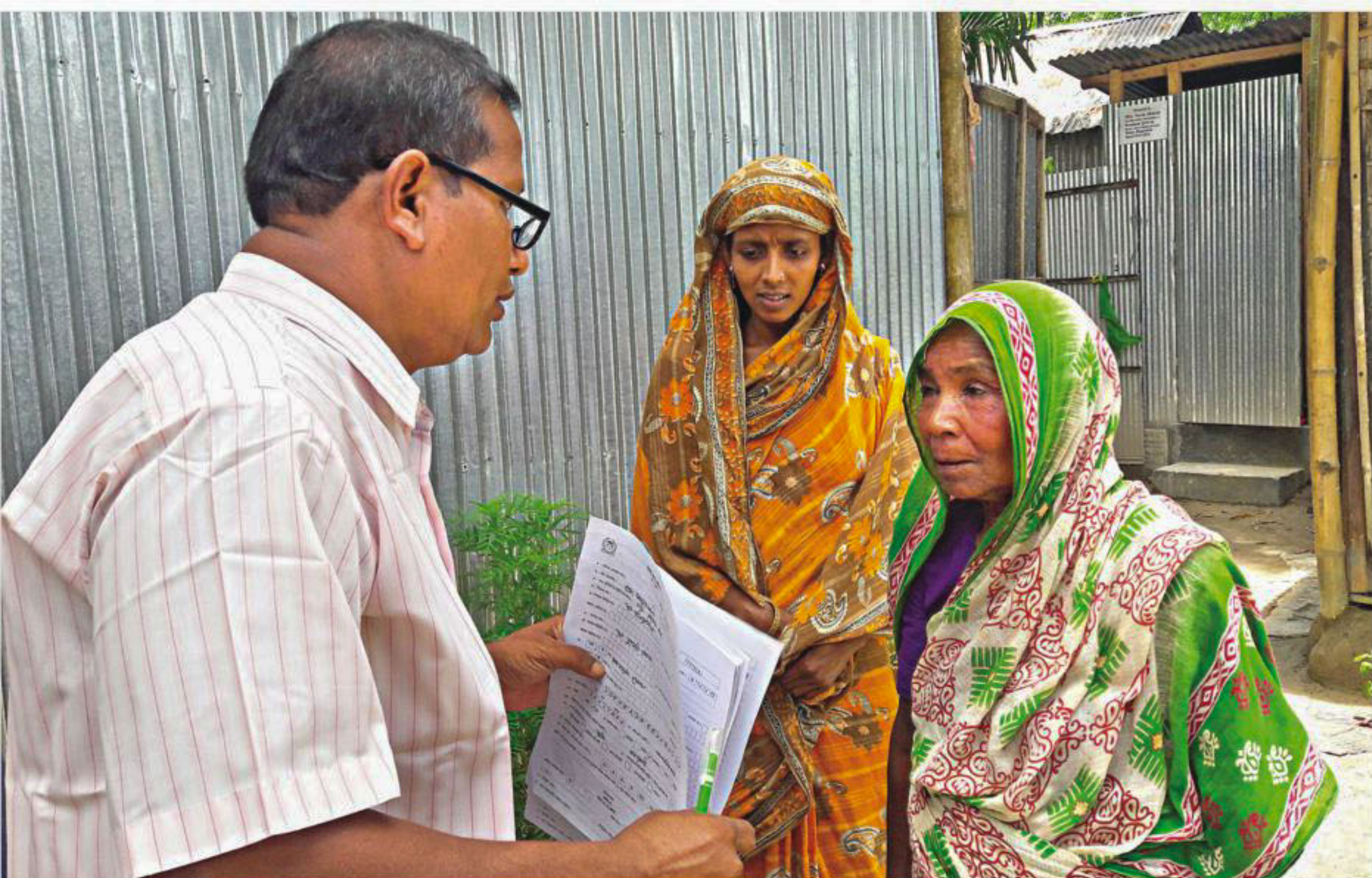
An enumerator collects personal data of two women of former enclave Bhitorkuti under Kulaghat union in Lalmonirhat Sadar upazila for listing them as voters. The photo was taken yesterday.