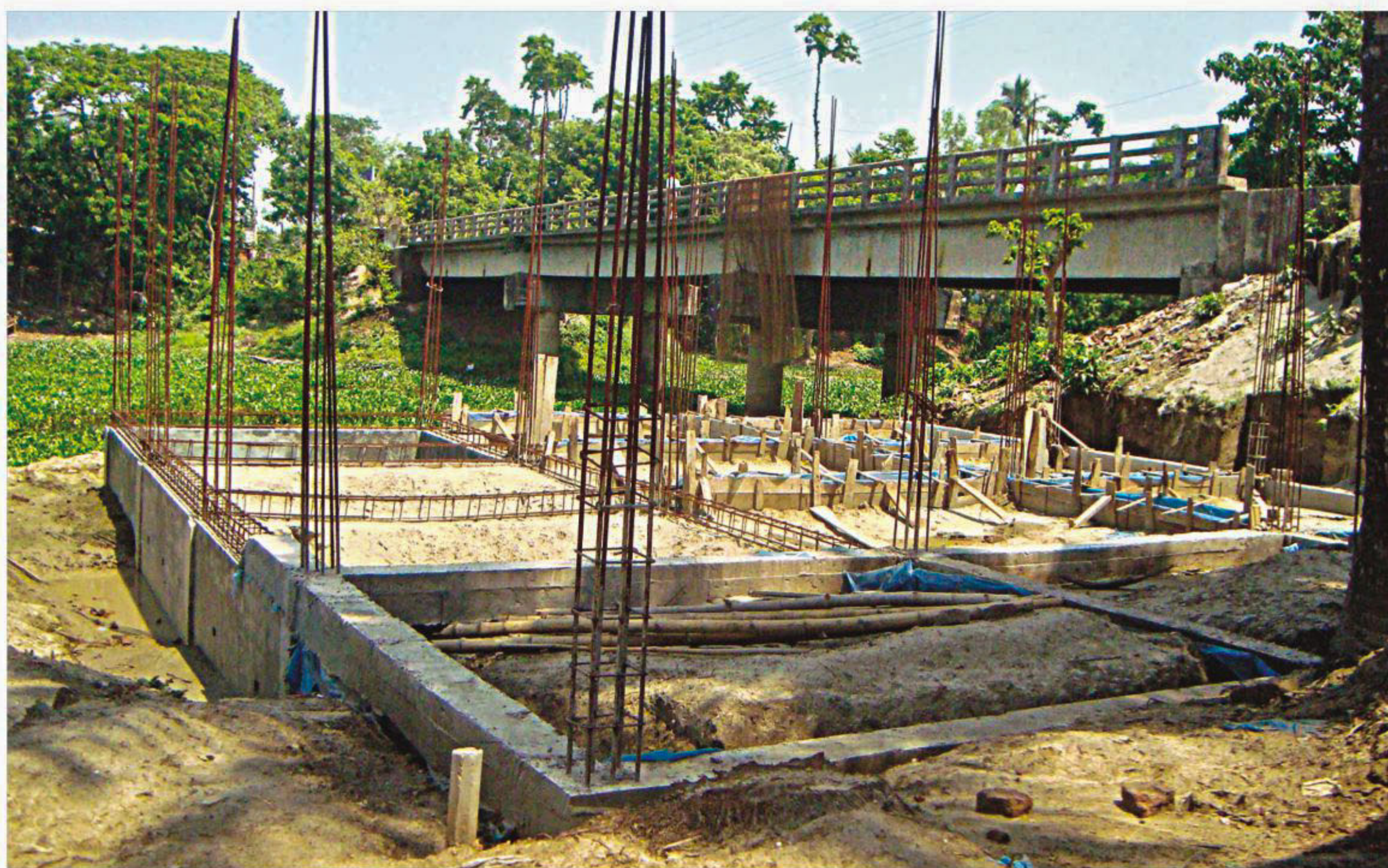
Construction of this large building on the land of the Kobadak beside Alampur Bridge in Moheshpur upazila under Jhenidah district further squeezes the already decaying river.