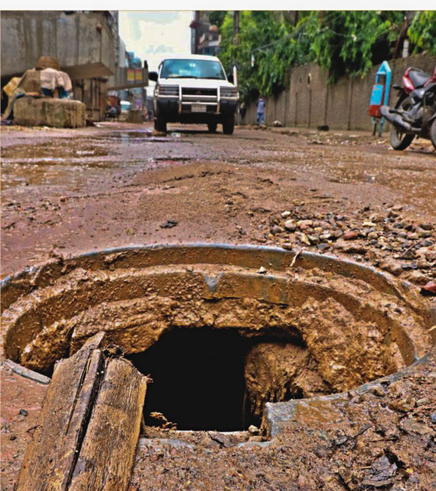
A sewer opening sans the lid right in front of the Rajarbagh Police Lines in the capital, posing the risk of an accident anytime. The photo was taken yesterday noon.