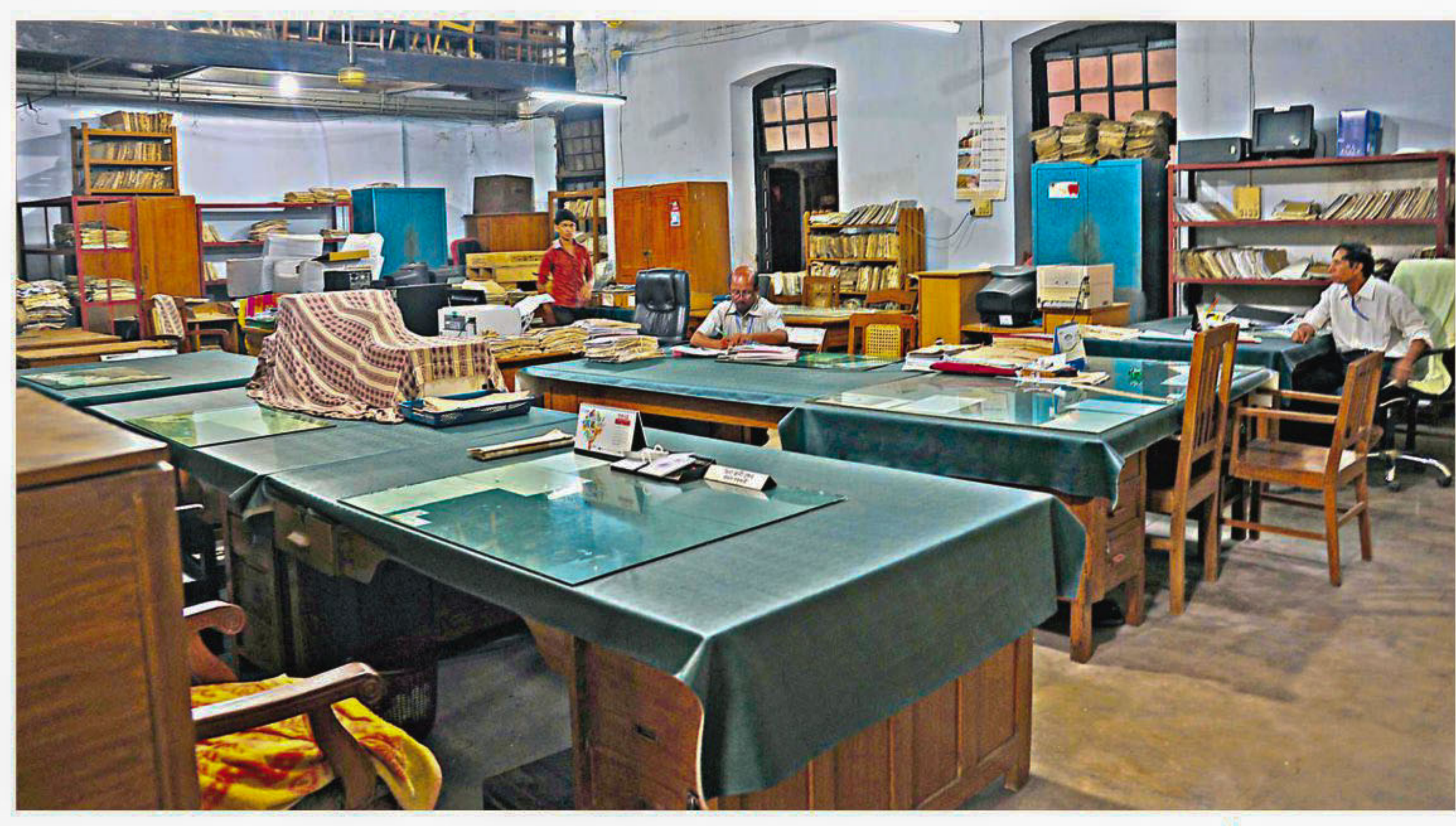
These empty chairs in Central Railway Building of the Bangladesh Railway's Eastern Zone headquarters in Chittagong city give a hint on the rate of attendance in government offices on the first workday yesterday following a nine-day holiday for public servants marking Eid-ul-Fitr. The photo was taken around noon.