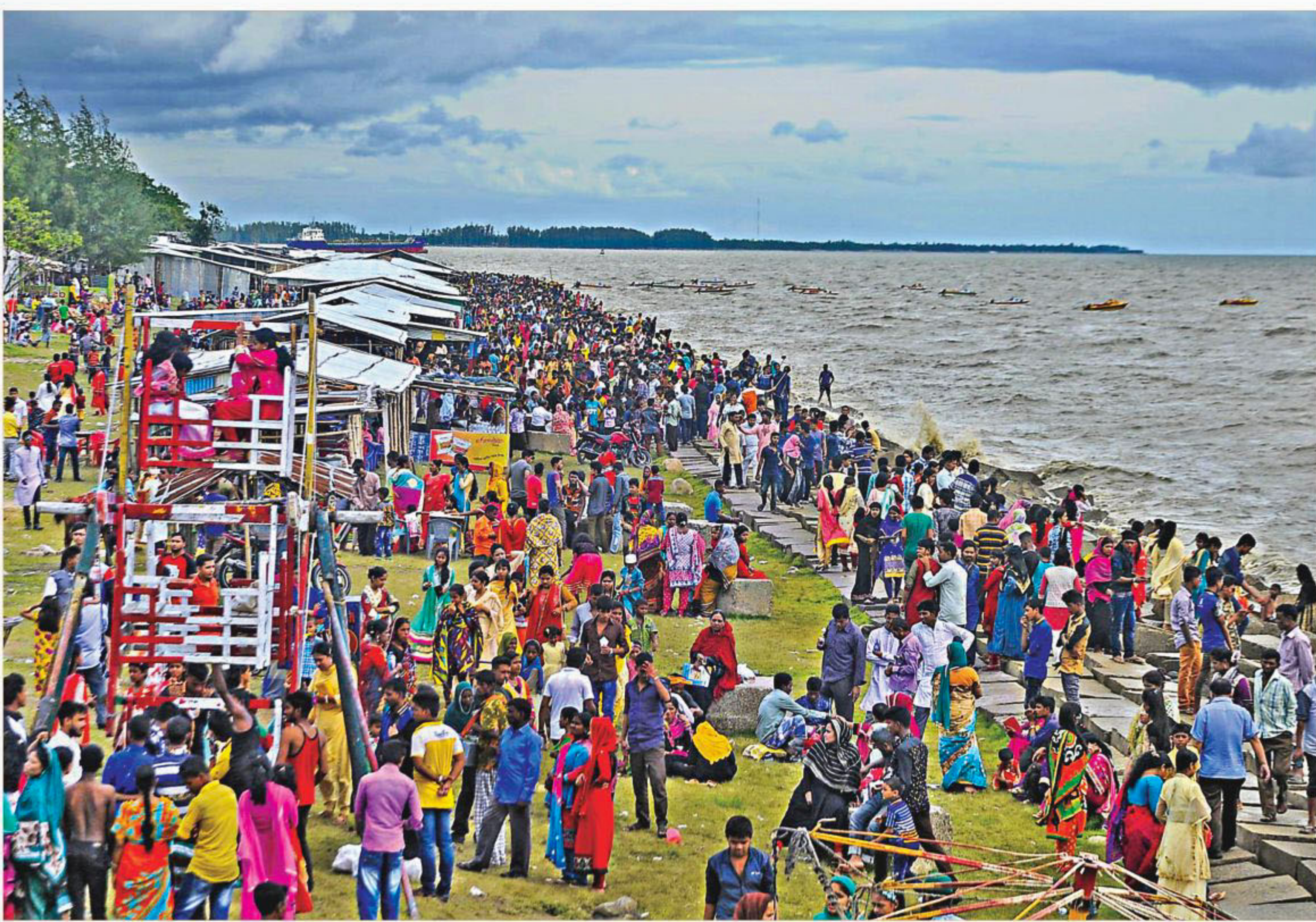
WON'T GIVE IN TO FEAR ... Refusing to be cowed by the terror attacks in Sholakia the day before and at Gulshan on July 1, people flocked to the Patenga beach in Chittagong city on Friday. More photos of Eid celebrations on Page 5.