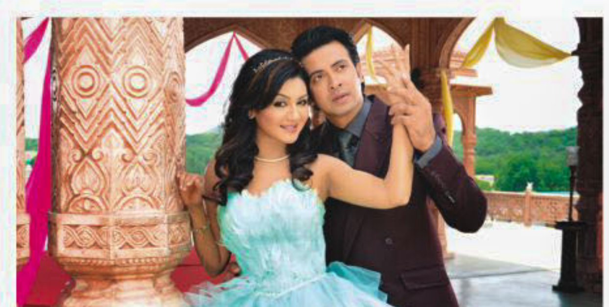
Film: "Purno Doirgho Prem Kahini 2"; ATN Bangla; Eid Day; 3:10pm.