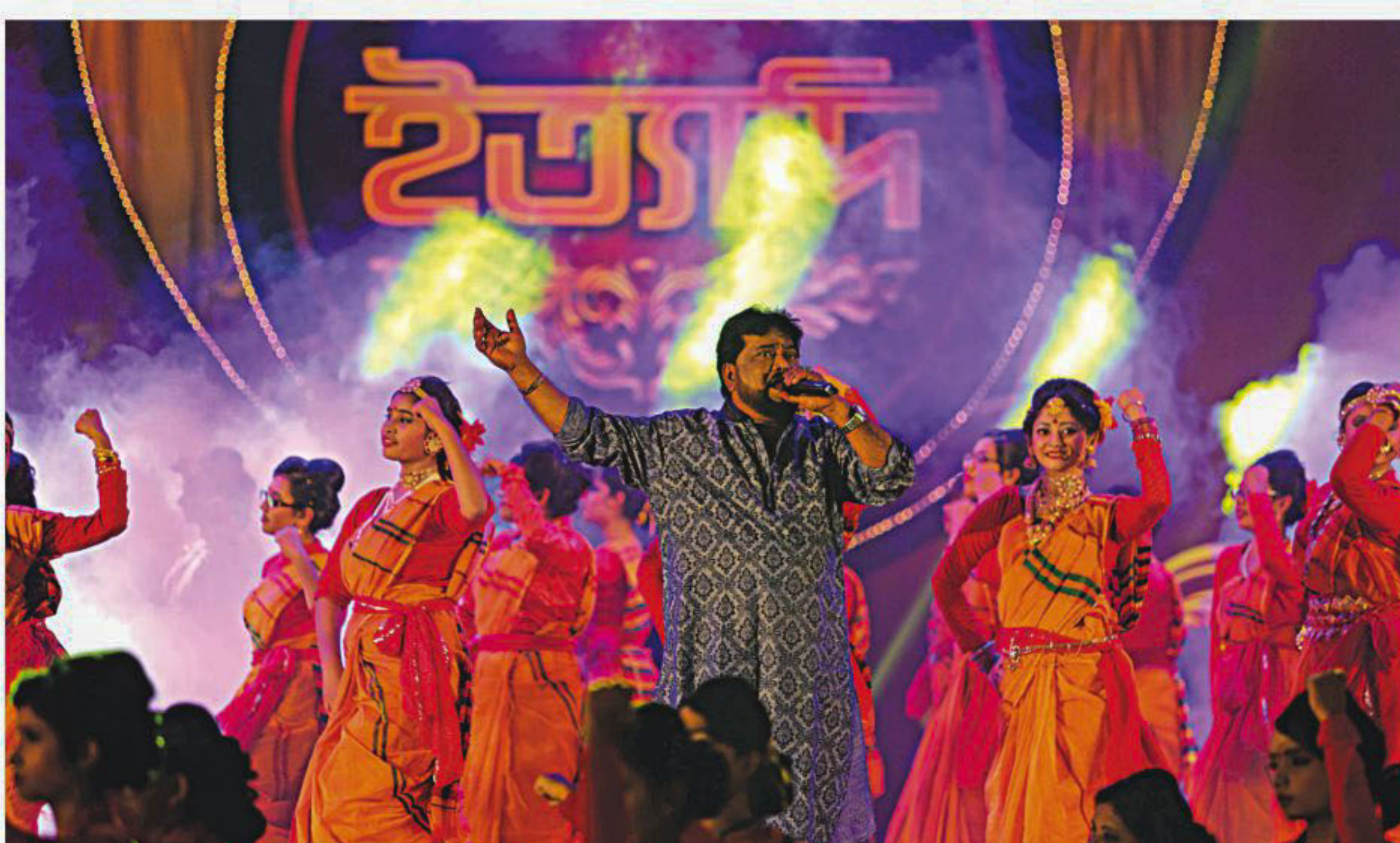
A scene from Eid special Ittyadi.