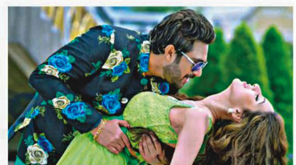
Film: "Black"; Channel i; 3rd day; 10:30am.

It's Eid... Once more TV channels vie for viewer attention. There's quite an offering out there--TV plays, tele-films, musical performances, celebrity adda, variety shows and much more. So viewers take time off from that hectic Eid revelry to see a programme that appeals to you.