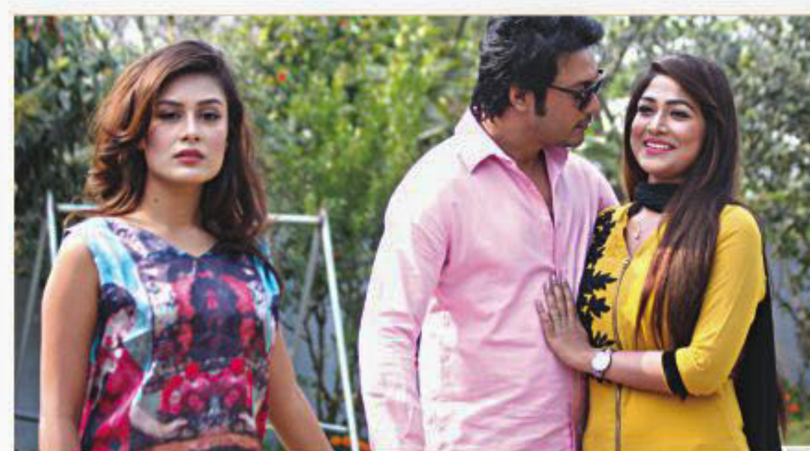
Tele-film: "Bhalobasha Dujonai"; Maasranga Television; 2nd Day of Eid; 2:40pm.