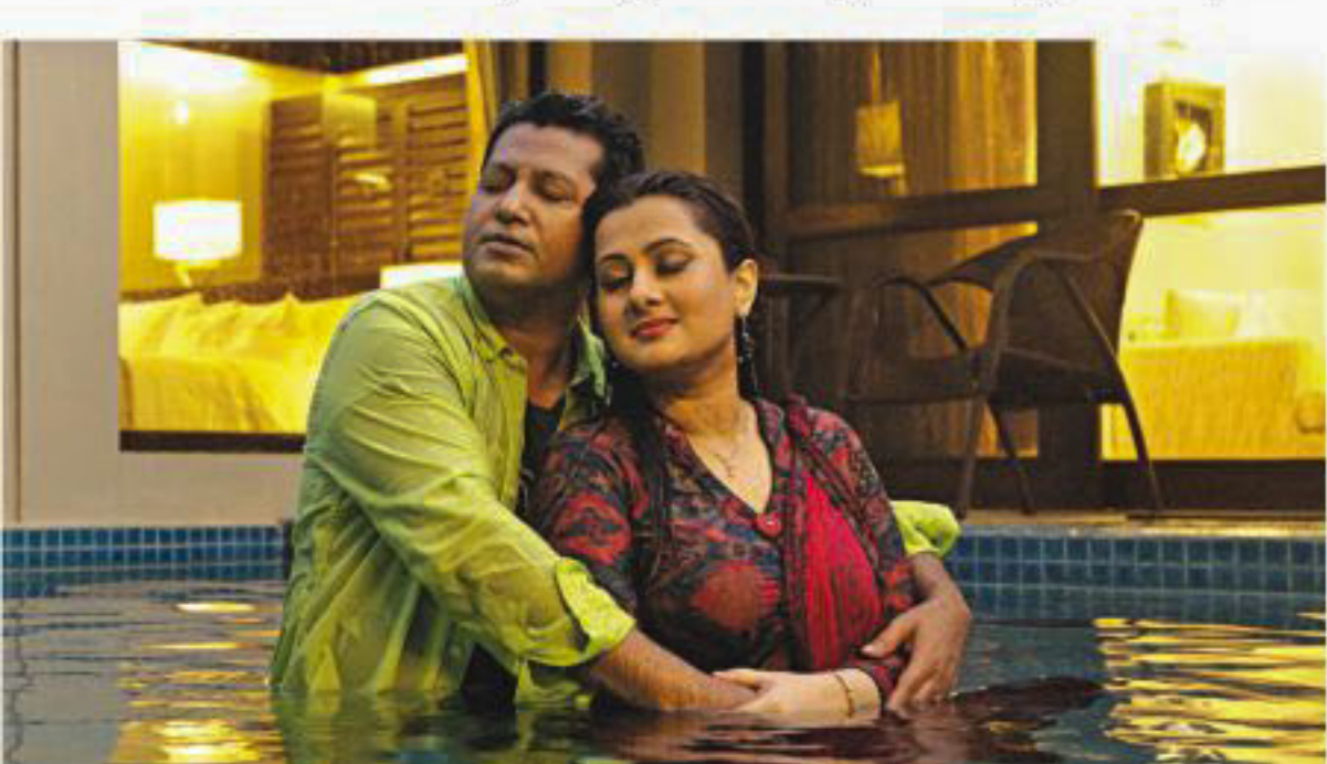
TV Serial: "Love and Co."; ntv; Eid day to 7th day; 6:10pm daily.