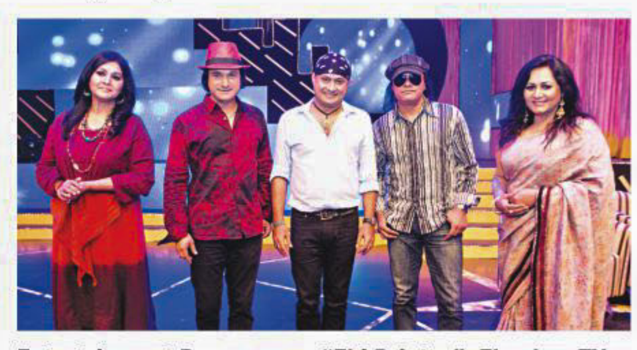
Entertainment Programme: "Eki Brintey"; Ekushey TV; Eid Day; 10:00pm.