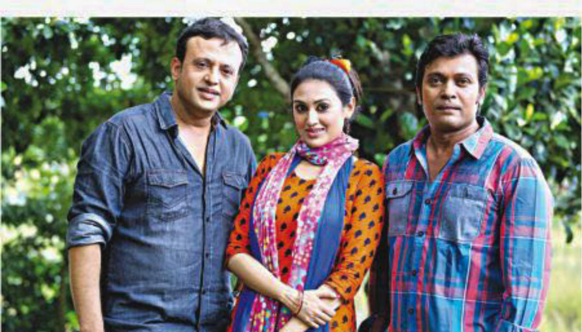
Drama: "Ester Mofiz"; Banglavision; 5th Day; 11:55pm.