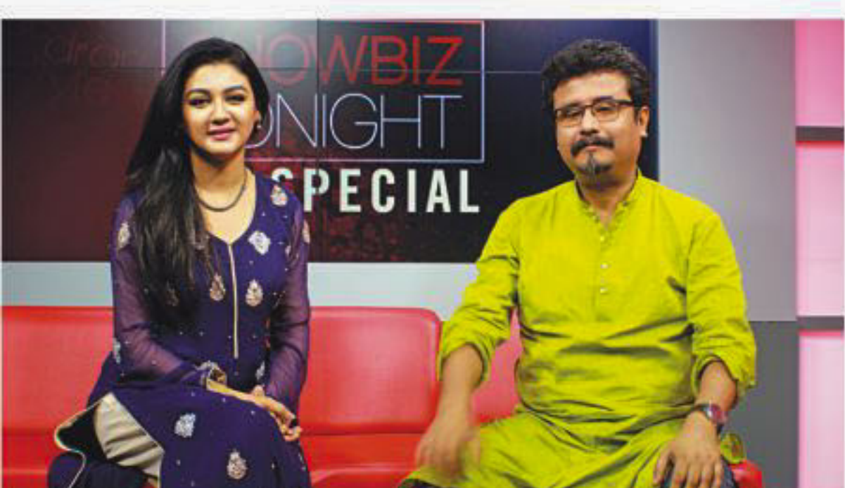
A scene from "Showbiz Tonight".