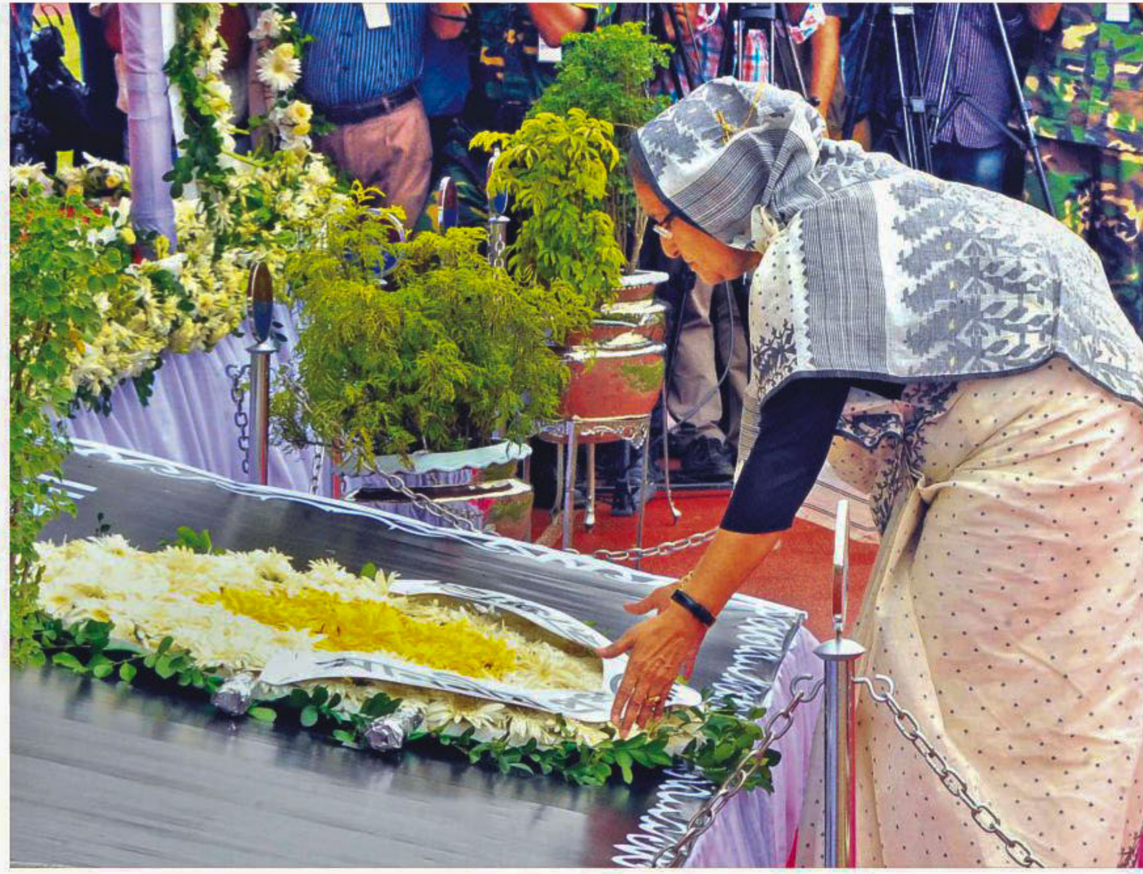
Prime Minister Sheikh Hasina pays homage to the 22 victims of Holey Artisan tragedy by placing floral wreaths at the Army Stadium in the capital yesterday. More photos on page 5.