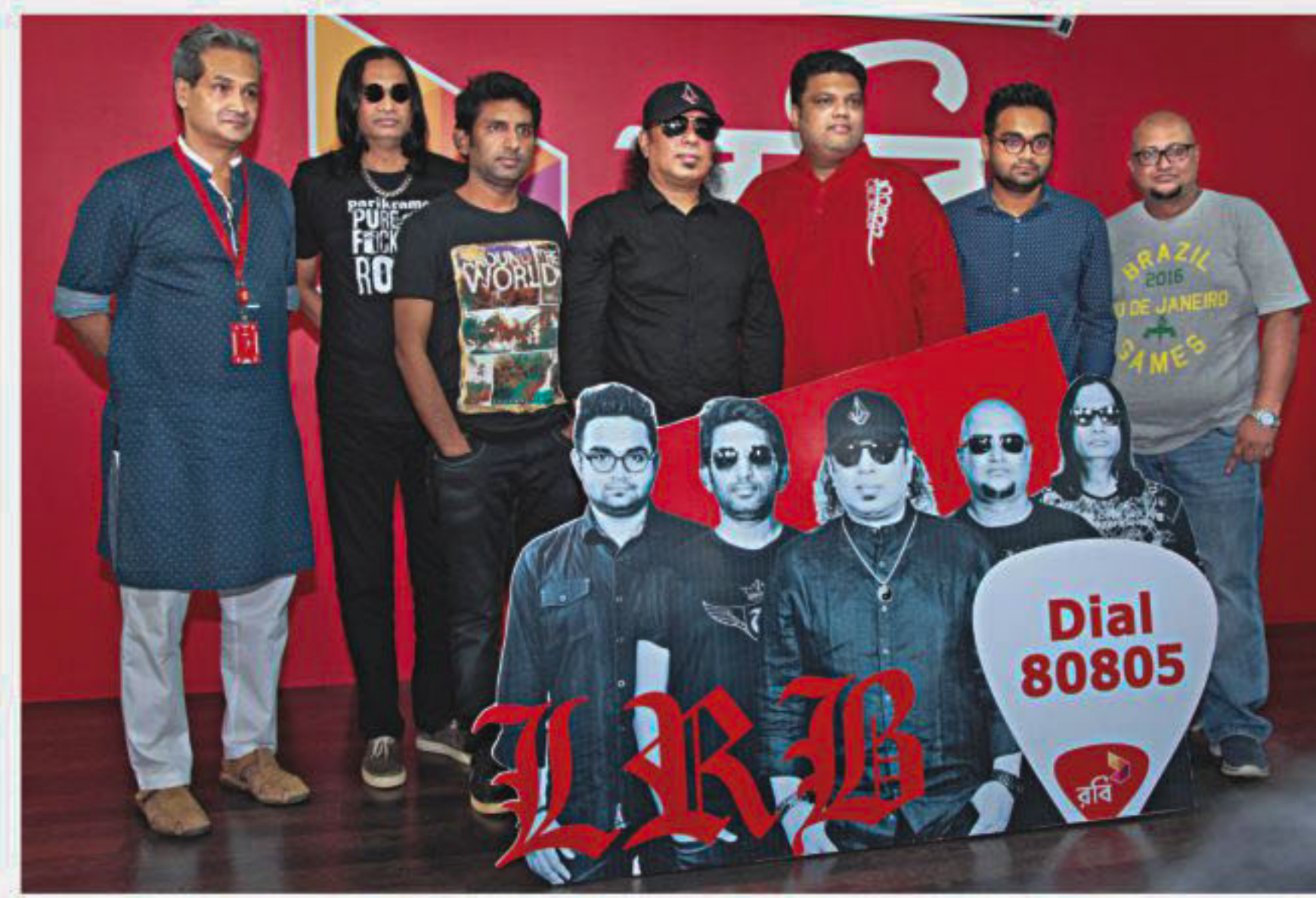
LRB members with the organisers at the press meet.

Celebrated rock band LRB has released its latest album "Rakhe Allah Mare Ke" ahead of the Eid-ul-Fitr on Robi Radio. Robi users can listen to the album exclusively by dialing 80805, says a press release.