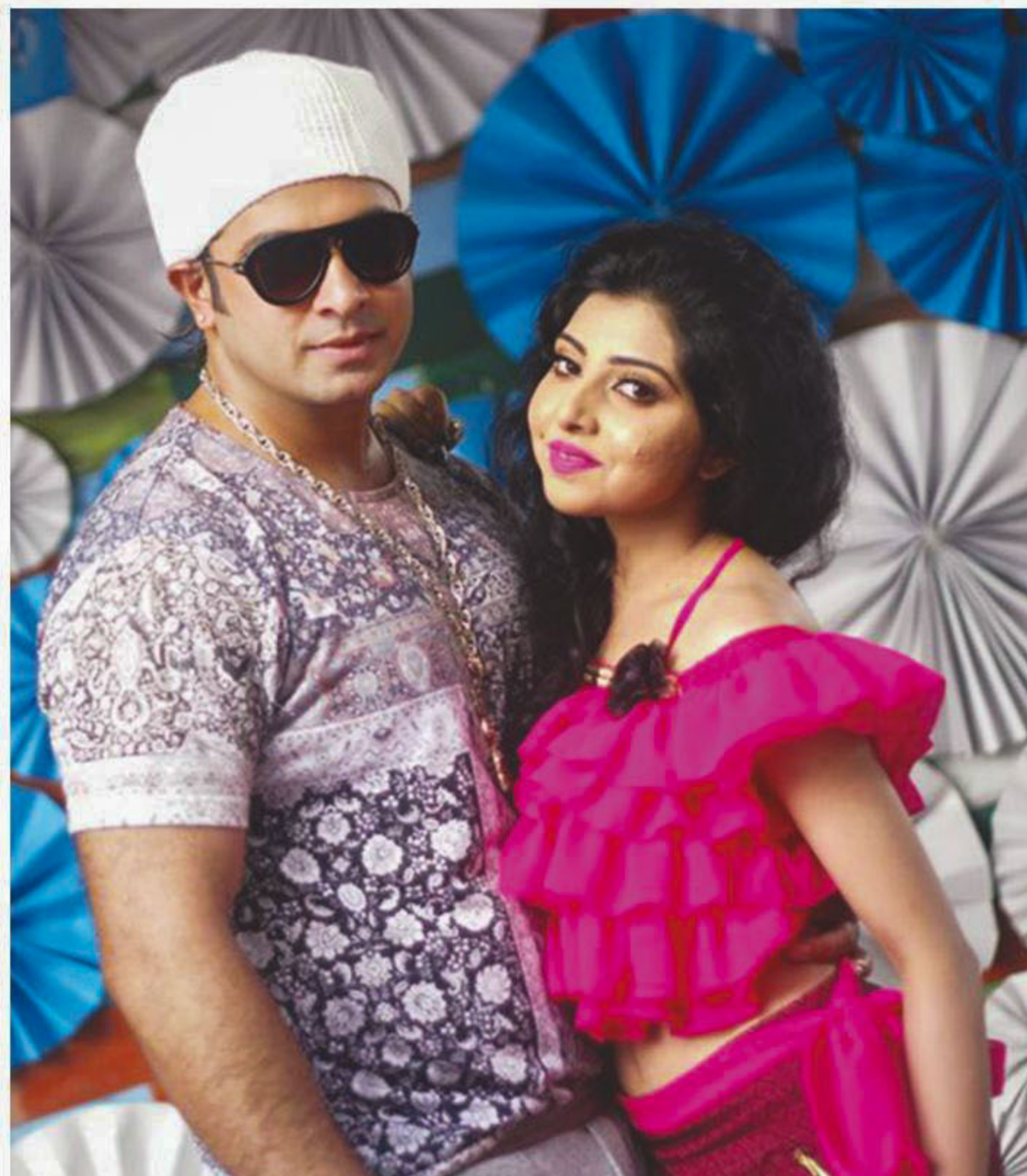
Shakib Khan & Porshi