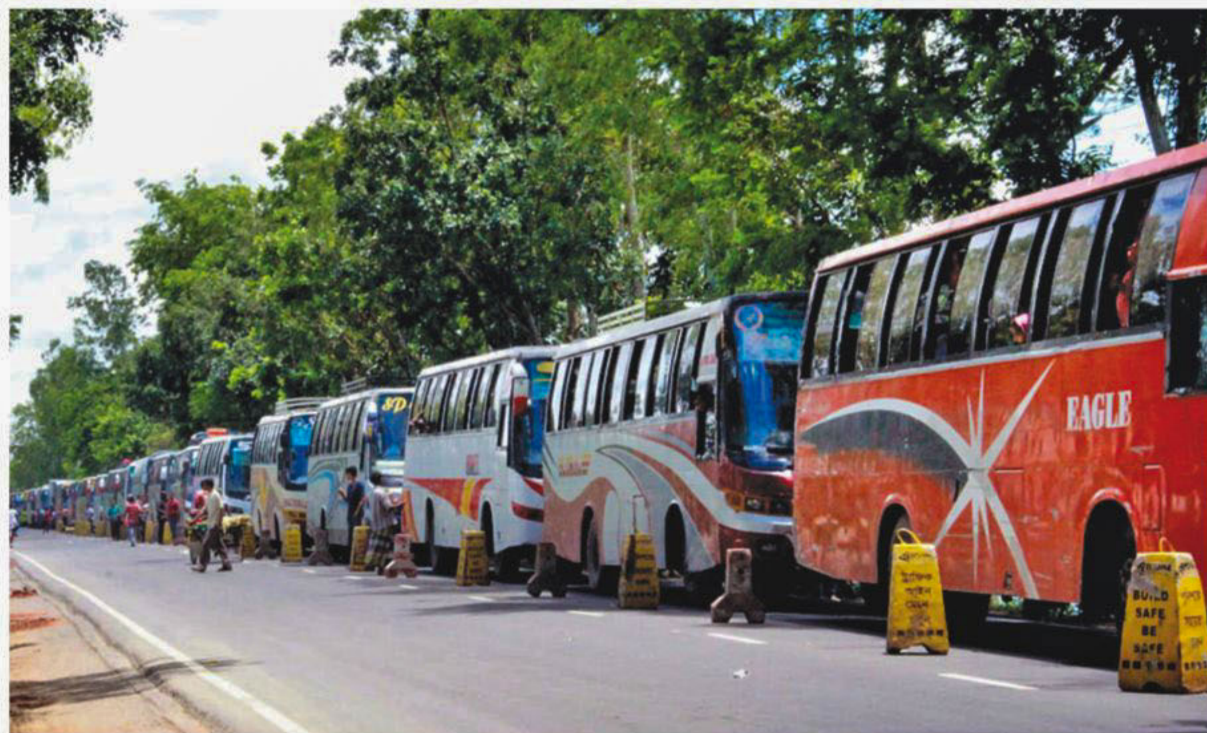
Buses queue up at Paturia ferry terminal in Shibaloy upazila of Manikganj yesterday to board ferries and cross the Padma. With thousands of holidaymakers leaving the capital on the first day of the nine-day Eid vacation yesterday, the traffic was heavy on the Dhaka-Paturia route. Because of the Eid rush, passengers and transport workers suffered at the terminal for hours.