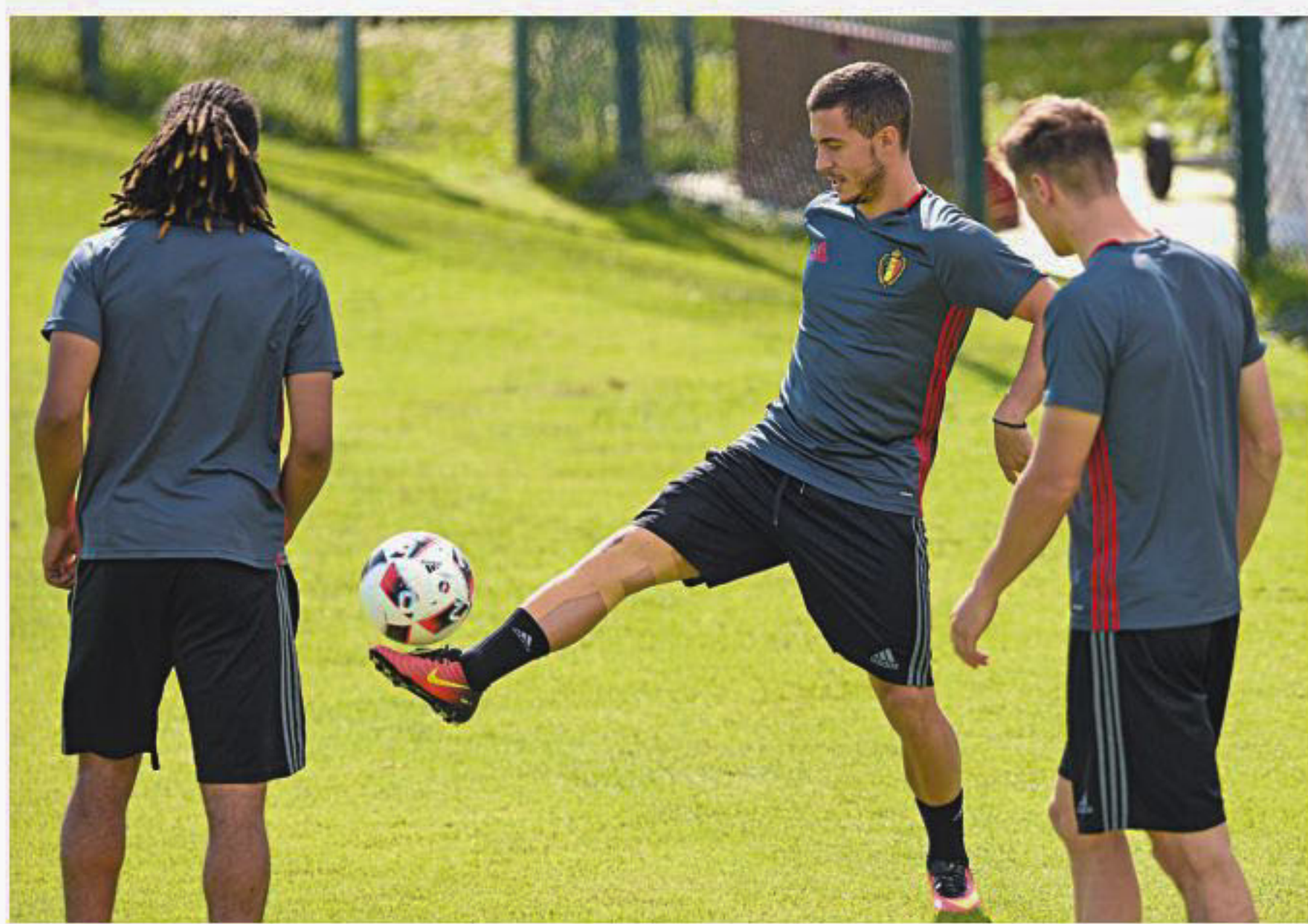
(L-R) Belgium star Eden Hazard and Wales star Gareth Bale (C) take part in their respective training sessions yesterday on the eve of their Euro 2016 quarterfinal in Lille.

Other names on a 90-page list issued by the Spanish tax office include former Barcelona player Gabriel Milito and MotoGP's Daniel Pedrosa.