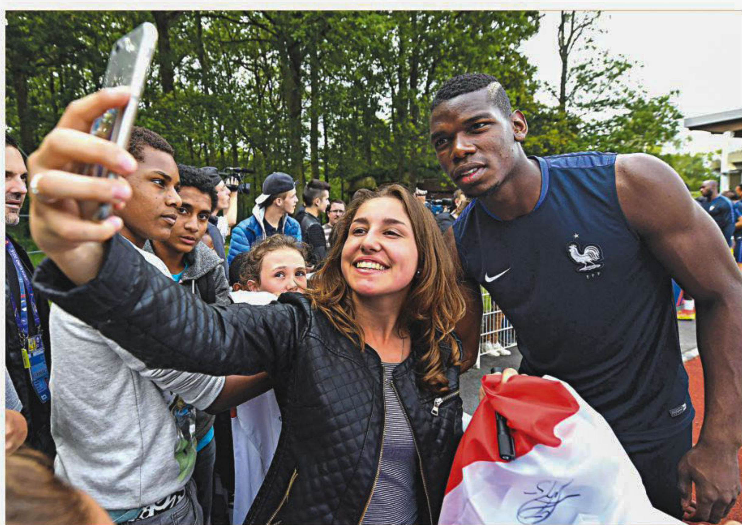
France midfielder Paul Pogba (R) poses for a selfie with a fan before a training session in Clairefontaine on Wednesday.

After a disappointing Euro campaign plagued by poor performances on the pitch and hooliganism in the stands, Slutsky said last week he would resign to let another coach manage the national team as Russia gears up to host the World Cup in 2018.