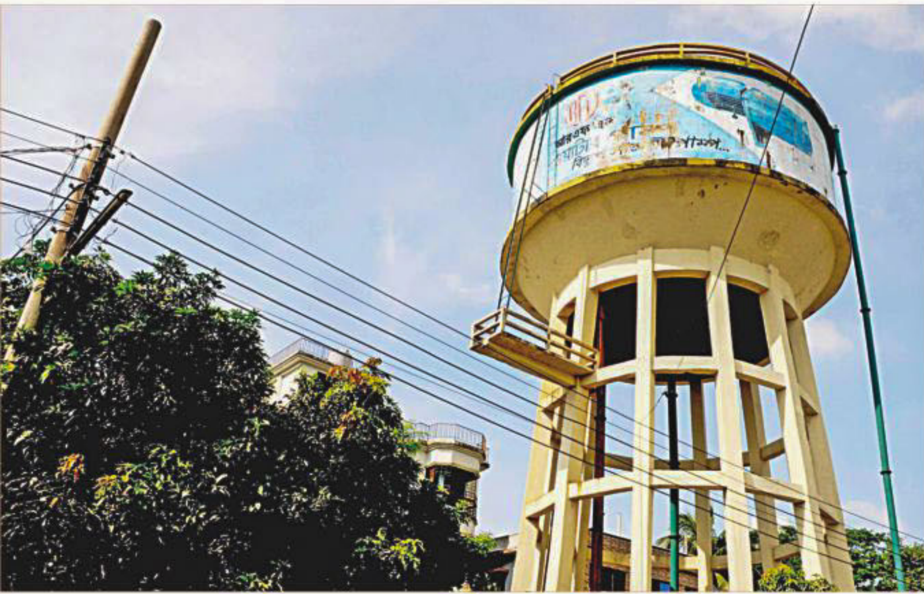
The Power Development Board disconnected electricity supply to this water tank in Bogra town, along with a few other set-ups yesterday, due to huge unpaid arrear bills. The action led to water crisis for the local residents.

The engineer further said he has been trying to get the allocation. He said the contractors will get their bills even if late. The work has been done with permission from the authorities, he said.