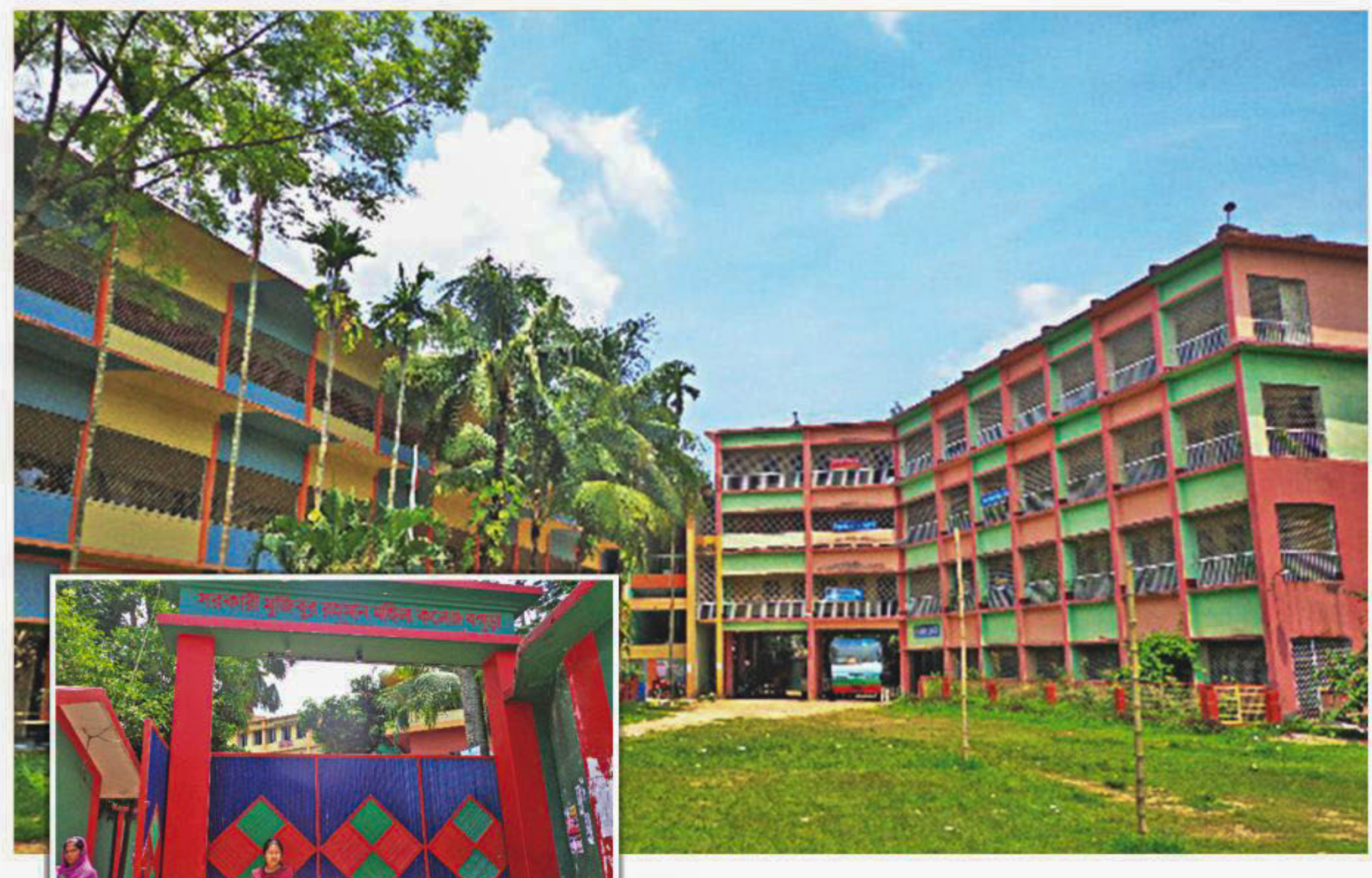
Government Mujibur Rahman Women's College, Bogra.

Around 8,000 students of the college have to accommodate themselves in around 400 private-run messes in areas near the college, she added.