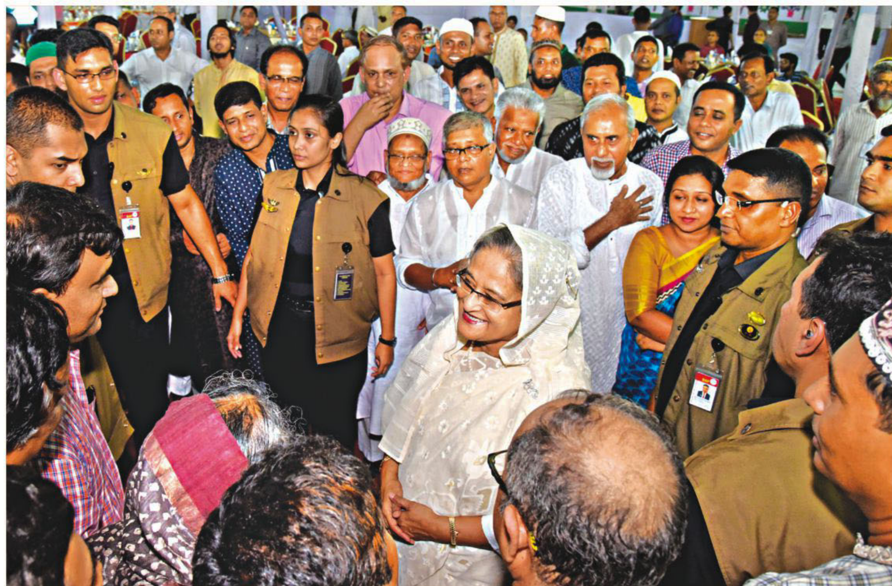
Prime Minister Sheikh Hasina exchanges greetings with people of different professions at an iftar organised in their honour at Gono Bhaban in the capital yesterday.