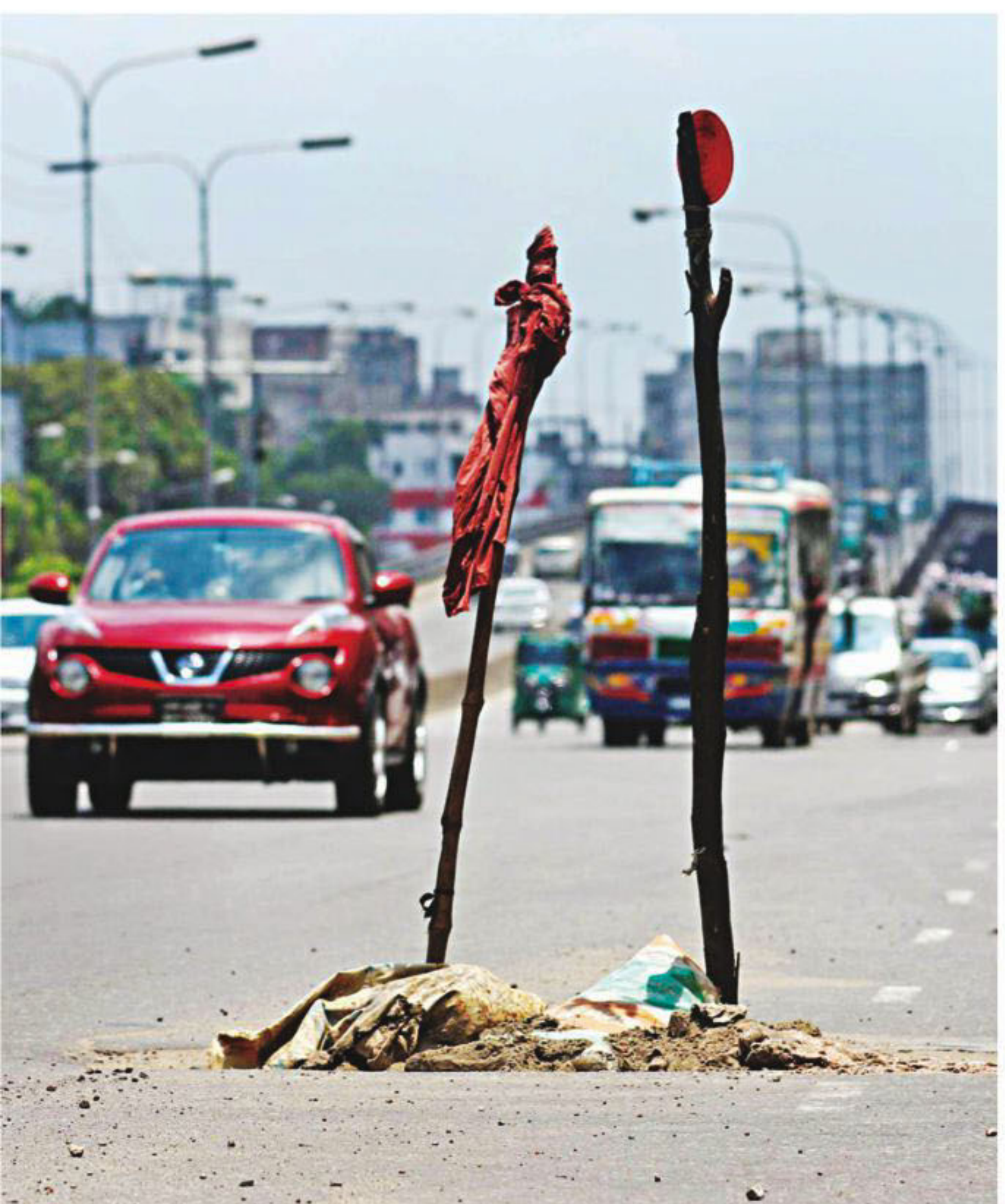
Sticks propped up on a manhole broken for long near the end of the Mohakhali flyover ramp, which lets vehicles head towards Chairmanbari, by nearby traders who claim some 10 accidents occurred there involving unsuspecting drivers. The photo was taken yesterday noon.