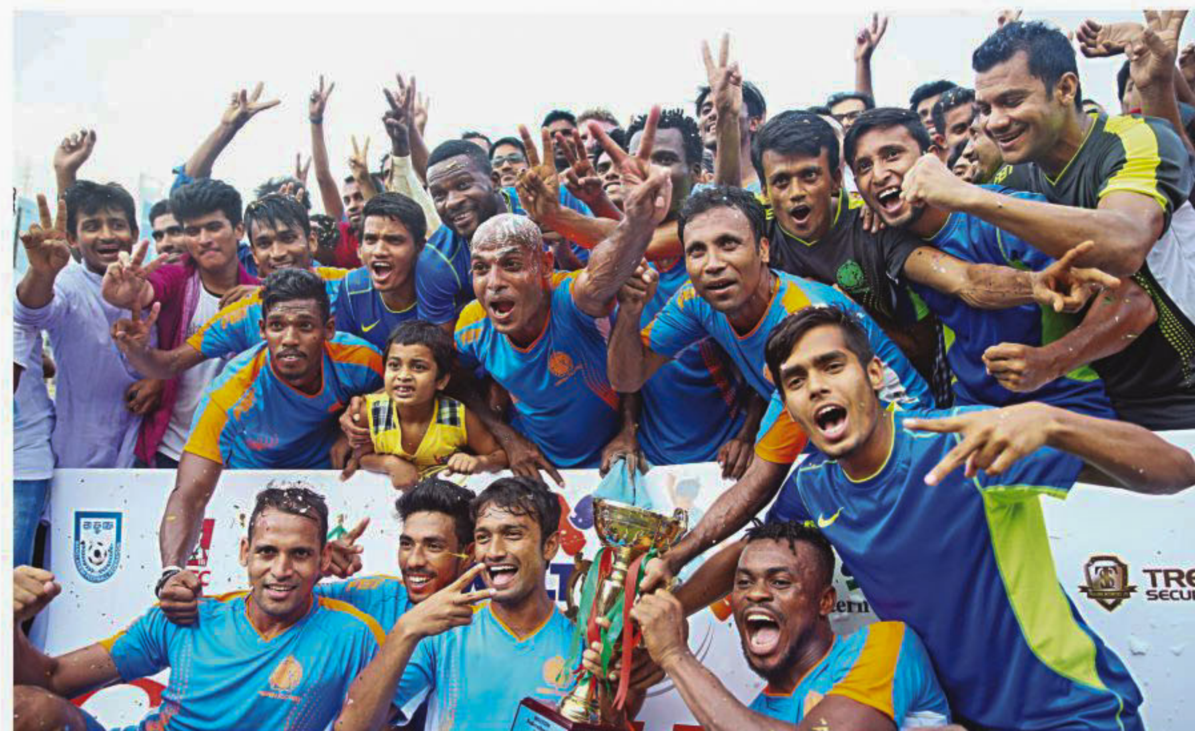
Abahani players celebrate with the trophy after slaying Arambagh KS 1-0 in the final of the Walton Federation Cup at the Bangabandhu National Stadium yesterday. This is Abahani's first major triumph since 2011.