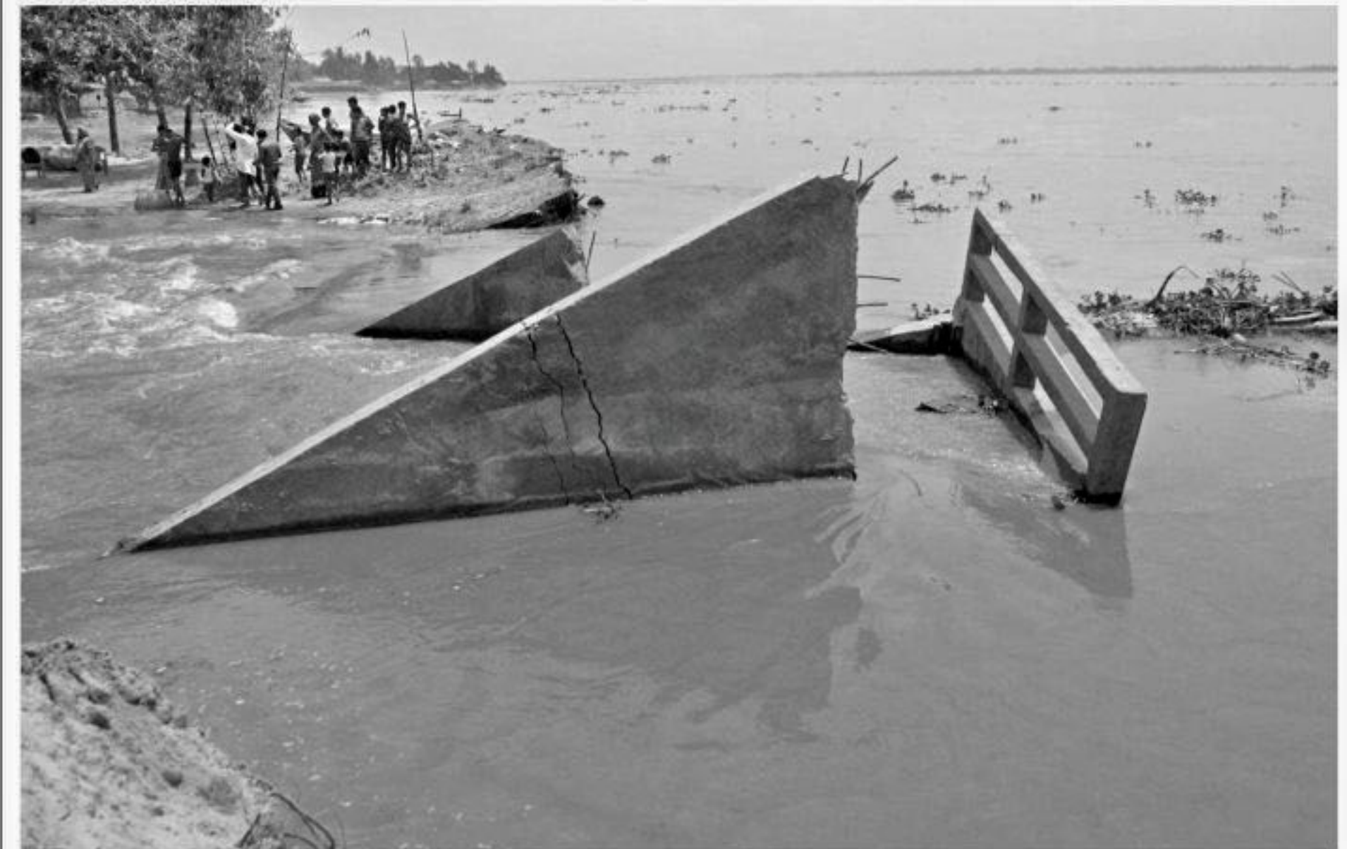
Around 20 villages got flooded as this sluice gate in Saghata upazila under Gaibandha district collapsed under the pressure of the swelling Jamuna River on Thursday.