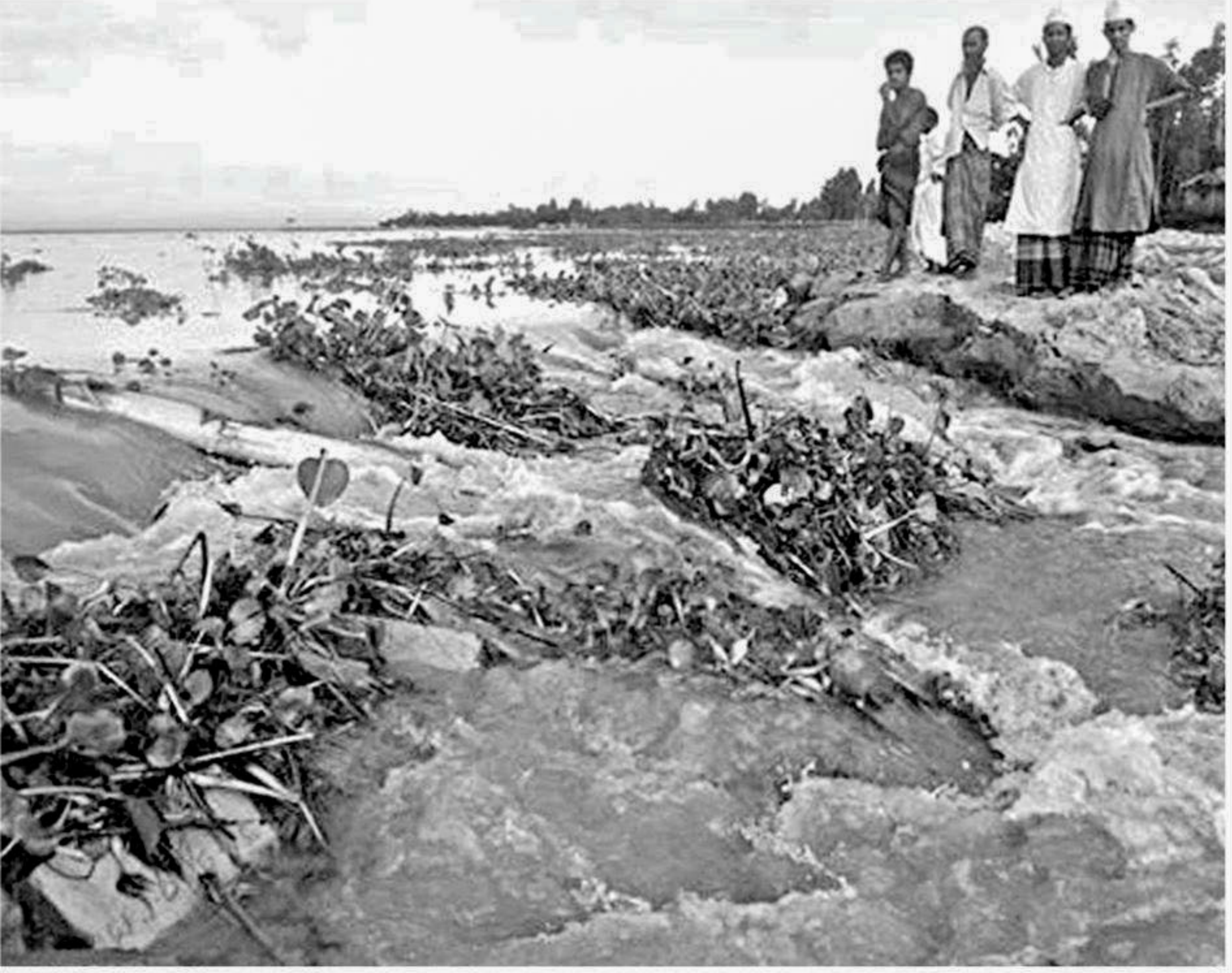
The overflowing Jamuna flooded this part of embankment, removing concrete blocks from there, at Baligugri village in Sirajganj Sadar upazila on Sunday.

"With increase of the river water, erosion started in different areas of Sirajganj district. The most vulnerable areas are in Sirajganj Sadar, Shahzadpur and Kazipur upazilas," he said.