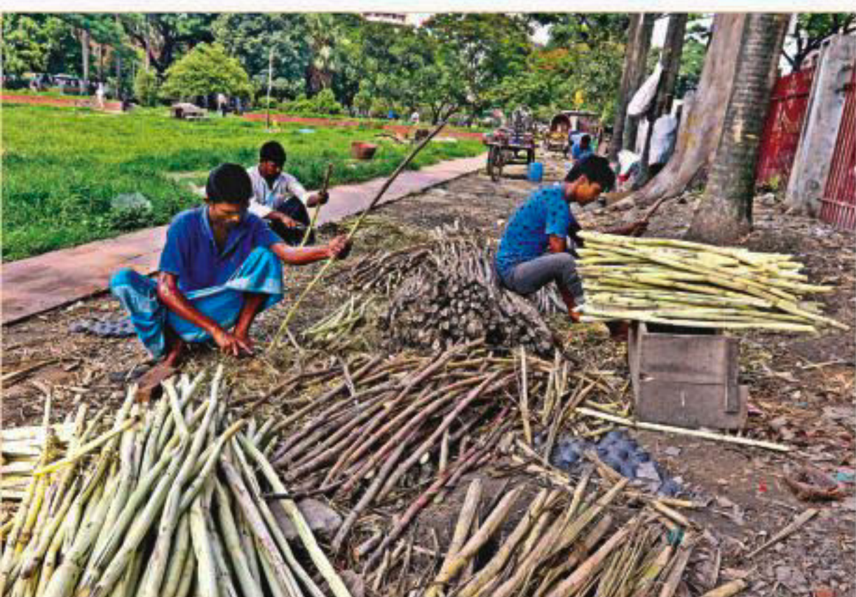
(Clockwise from top right) A man makes the most of what is left of a bench in the park opposite Tejgaon College in the capital's Farmgate. Trolleys used by vendors to sell food and drinks on the streets stored inside the park. Traders who sell sugarcane juice on the footpath along Indira Road use the park to process their raw materials. Squatters too make the park their home. A collapsed steel umbrella lies rusting in the dust, providing a place to rest weary legs instead of shade. The photos were taken recently.