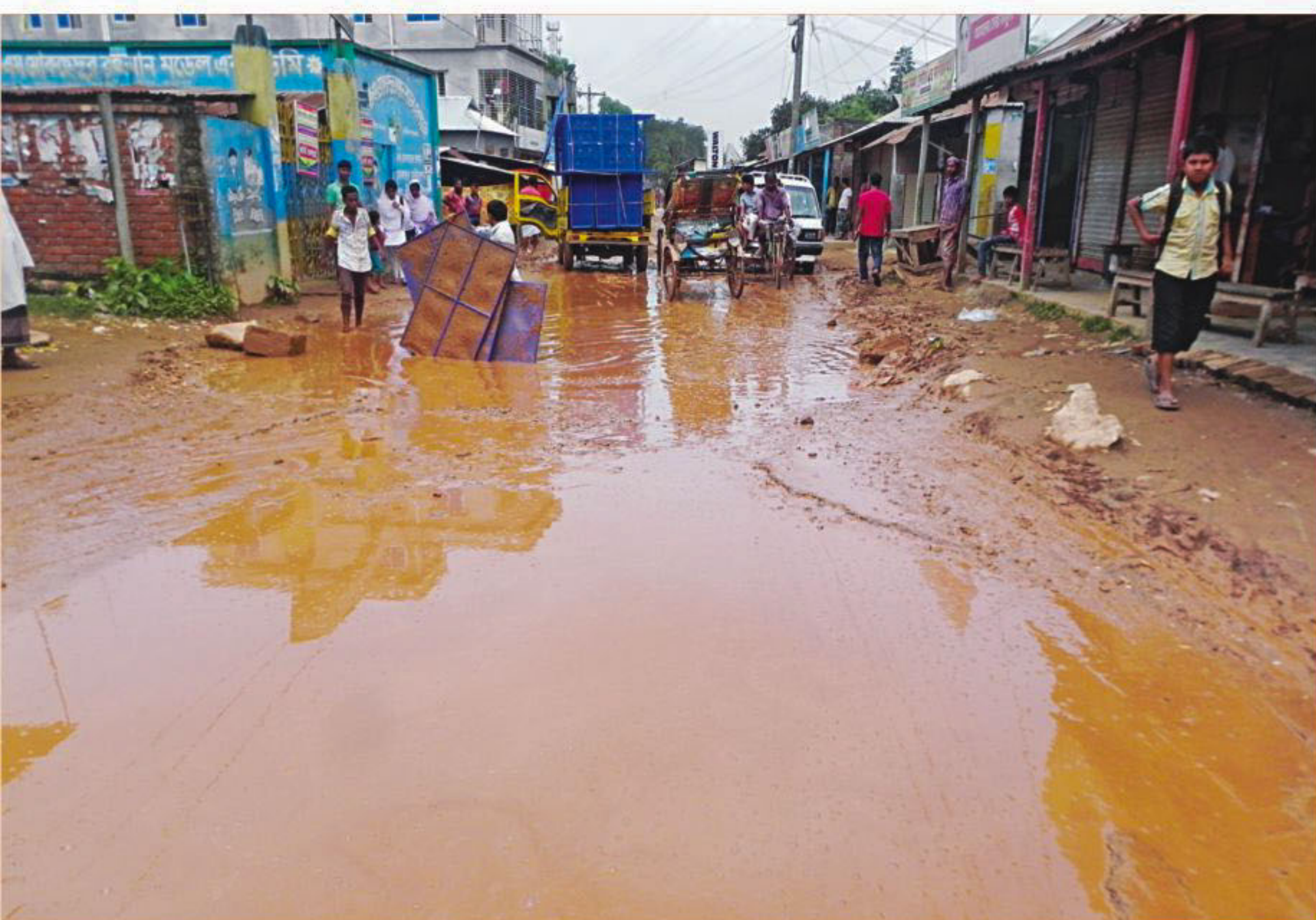
Vehicles struggle to move over Joina Bazar-Kaoraid road in Sreepur upazila of Gazipur as the waterlogged portion stretching half a kilometre of the road got completely damaged with the monsoon beginning this year. The photo was taken recently.