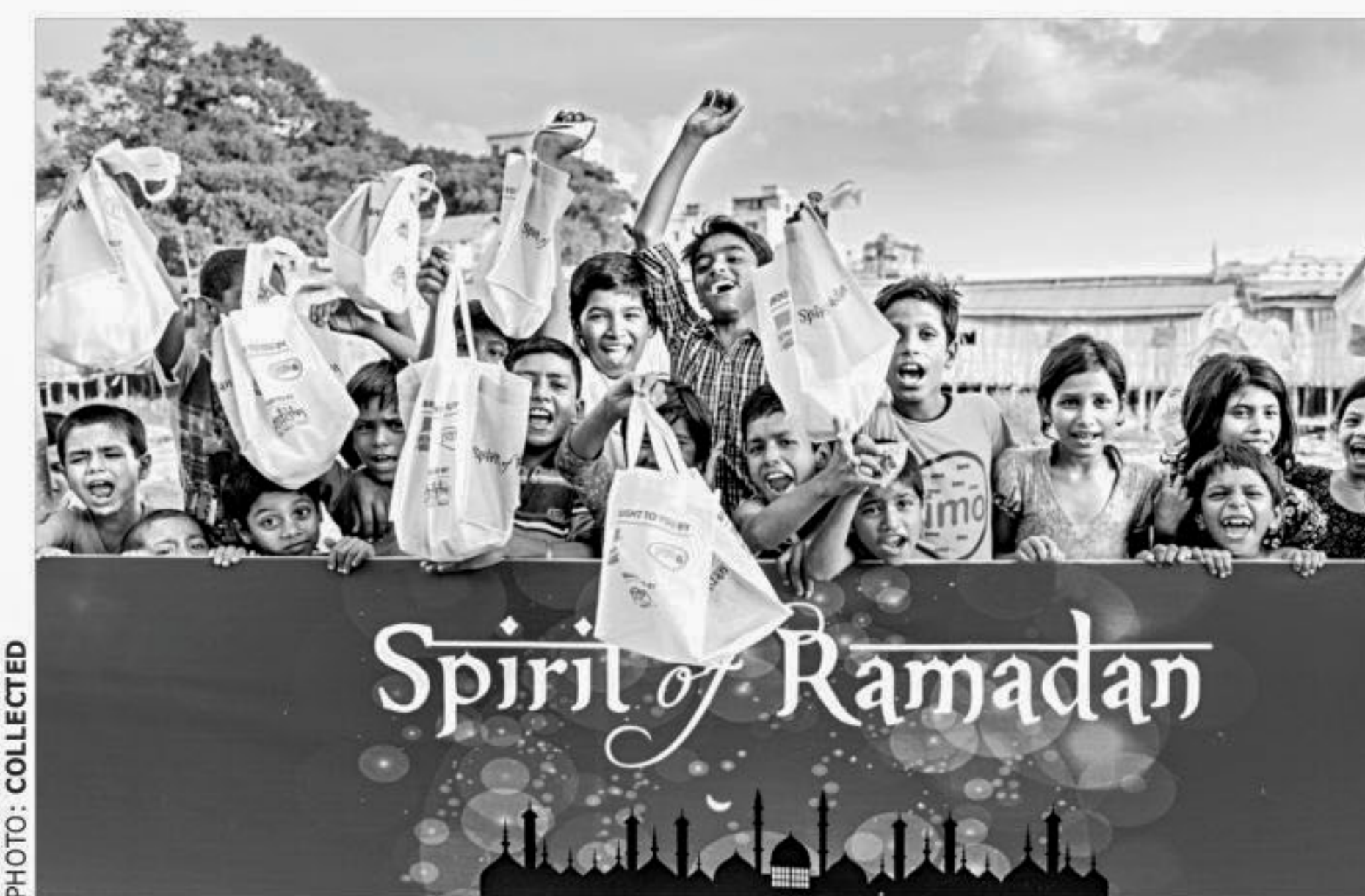
The underprivileged children cheering up after receiving the iftar items provided jointly by Knorr and Pureit as part of their "Share a Meal Campaign" to distribute over 2,500 meals to the deprived, needy people in this Ramadan. They are also inviting others through social media to join the laudable initiative supported by Bidyanondo, a voluntary organisation dedicated to wellbeing of the poor.