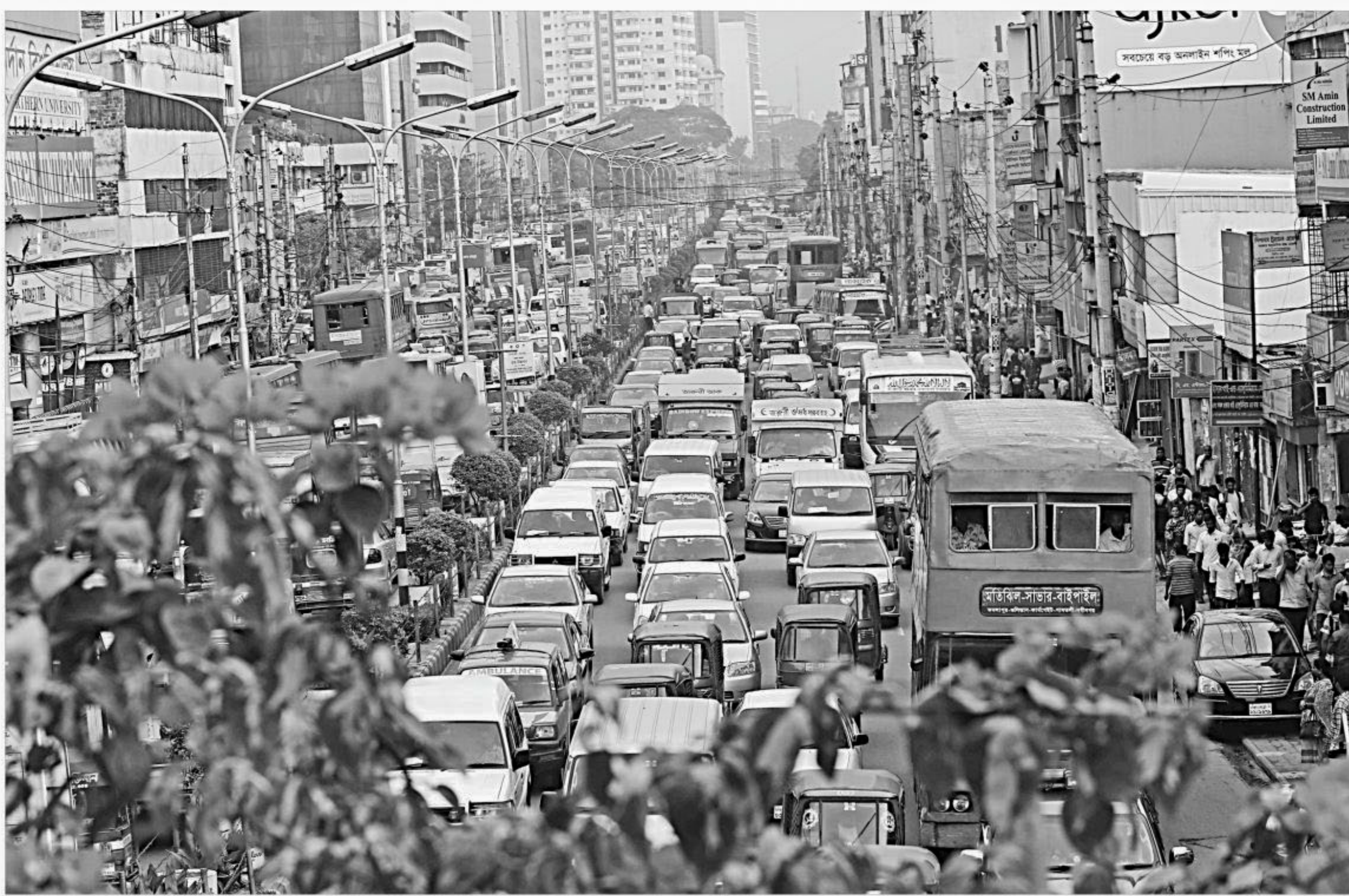
The afternoon rush of people returning home from work is regularly leading to long tailbacks on Kazi Nazrul Islam Avenue in the capital, causing loss of time, fuel and energy apparently in want of better traffic management. The photo was taken yesterday.