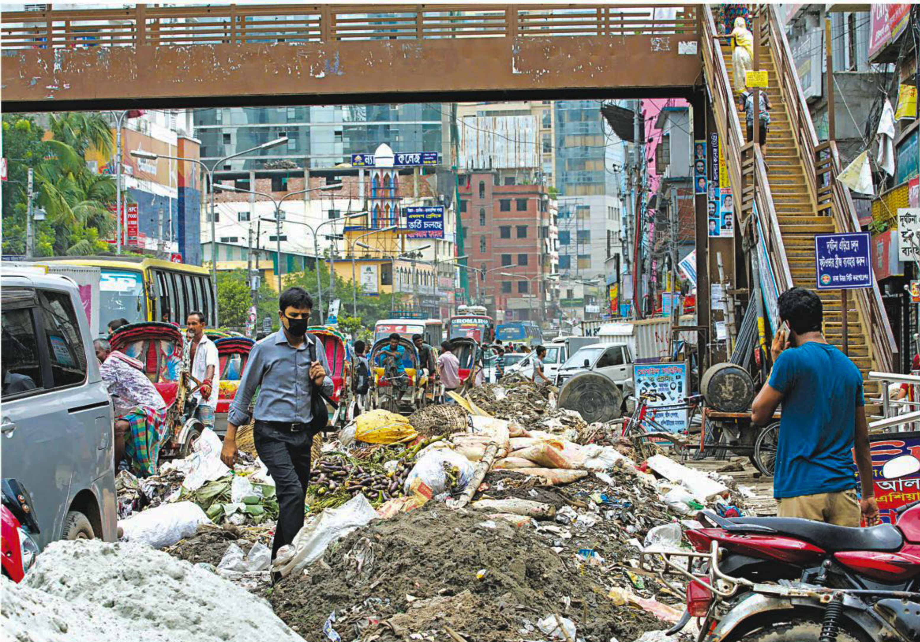
Vehicles and pedestrians try to avoid and get through the piles of garbage and building materials left on the Bir Uttam Rafiqul Islam Avenue at Madhya Badda in the capital. The photo was taken at 10:20am yesterday.