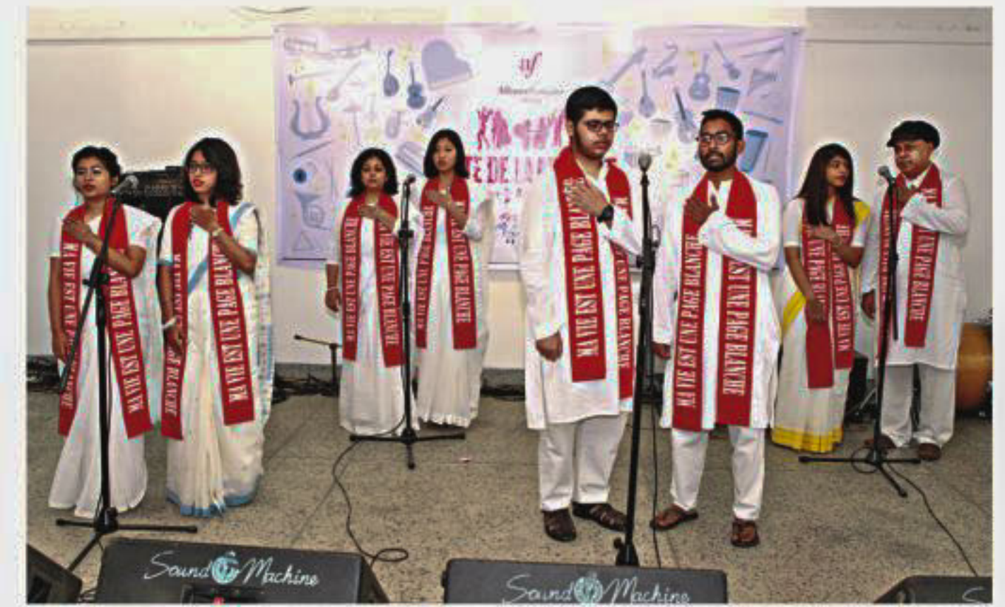
AFD students render a chorus on the first day.

Fête de la Musique began in France in 1982, and is now celebrated in 120 countries. The idea was conceived by French Minister of Culture, Jack Lang, in 1981. Since then, June 21 has been celebrated every year as the World Music Day. The concept of Fête de la Musique is an open air and non-stop musical performance, to make different genres of music accessible to the public.