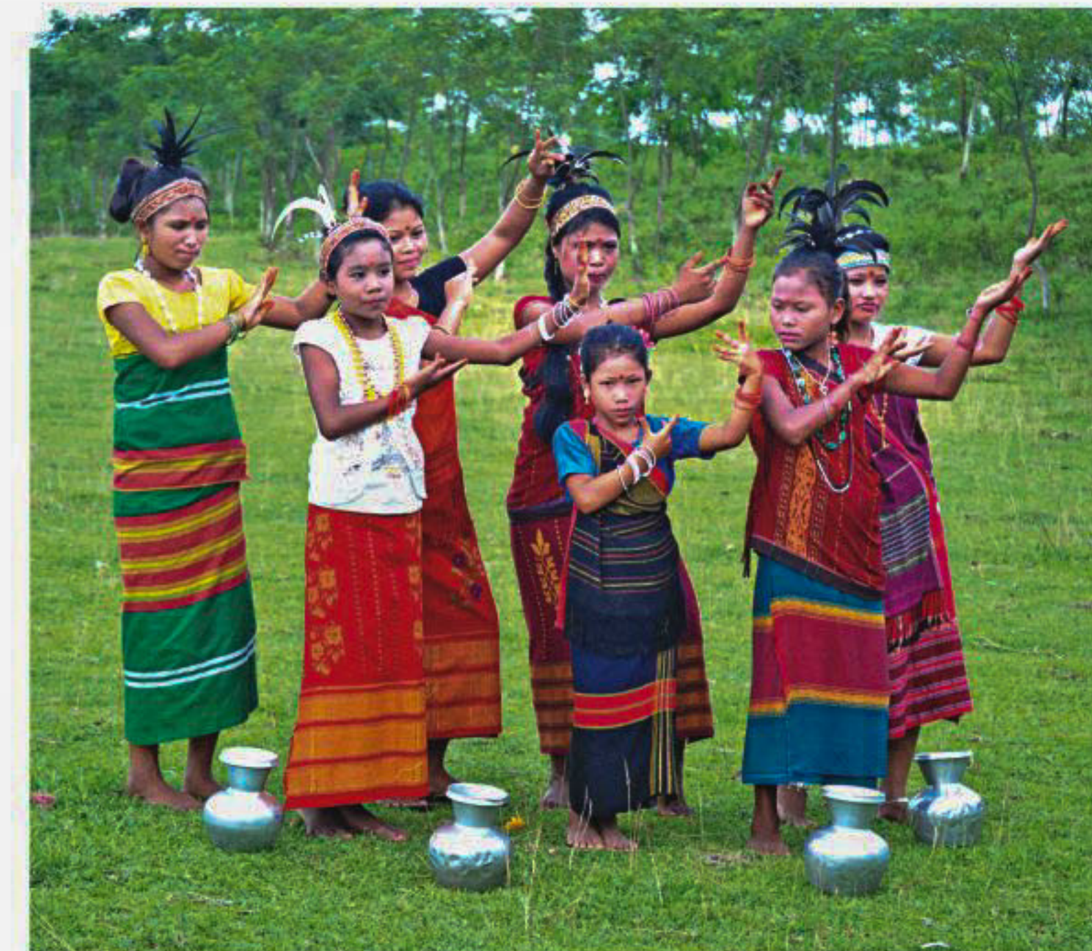
Indigenous girls pose for a photo.

After the competition, the chief guest and other dignitaries distributed prizes among the winners.