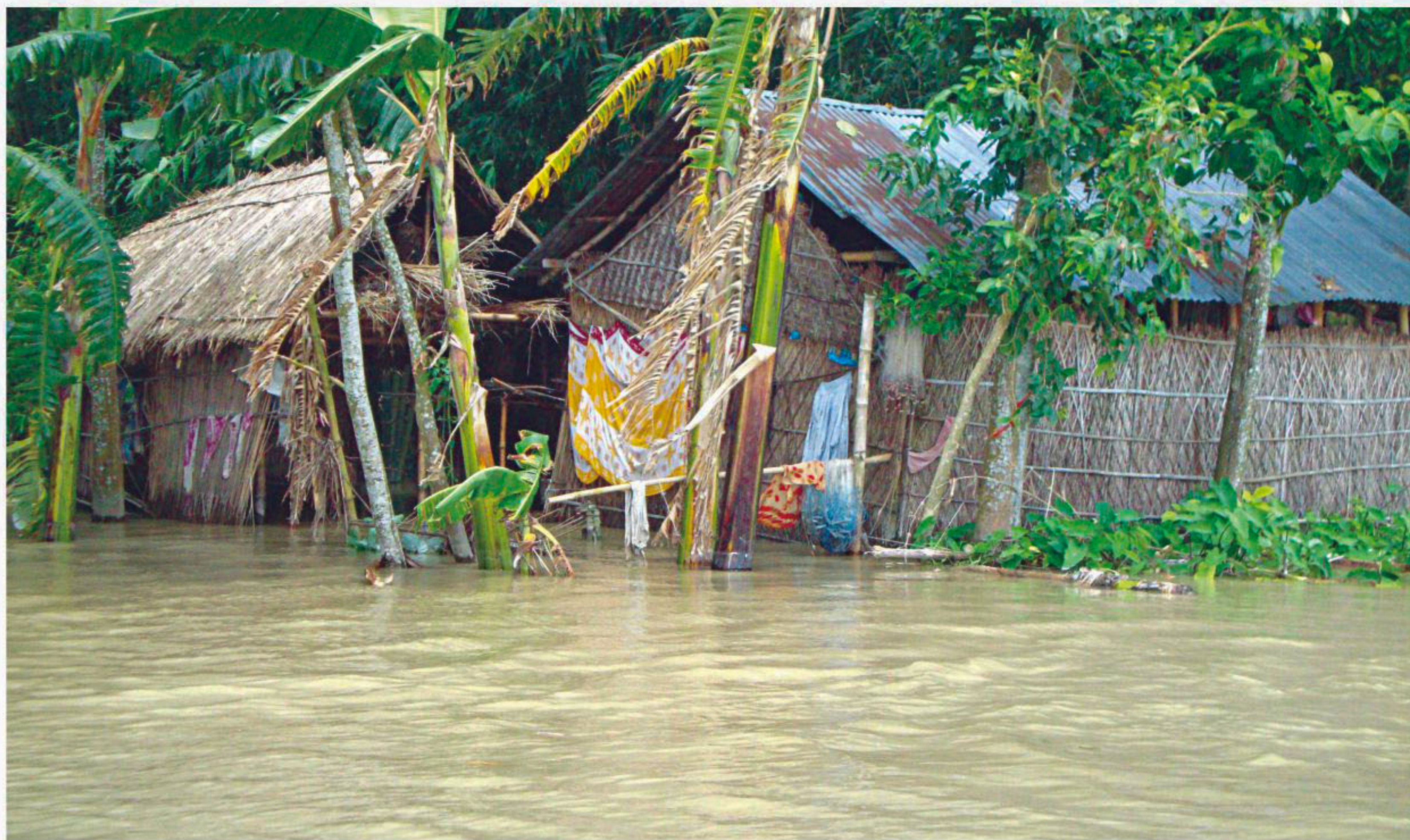
Torrential rain and onrush of water from upstream have submerged Sindurna village in Lalmonirhat's Hatibandha, leaving thousands of people marooned. The photo was taken yesterday.