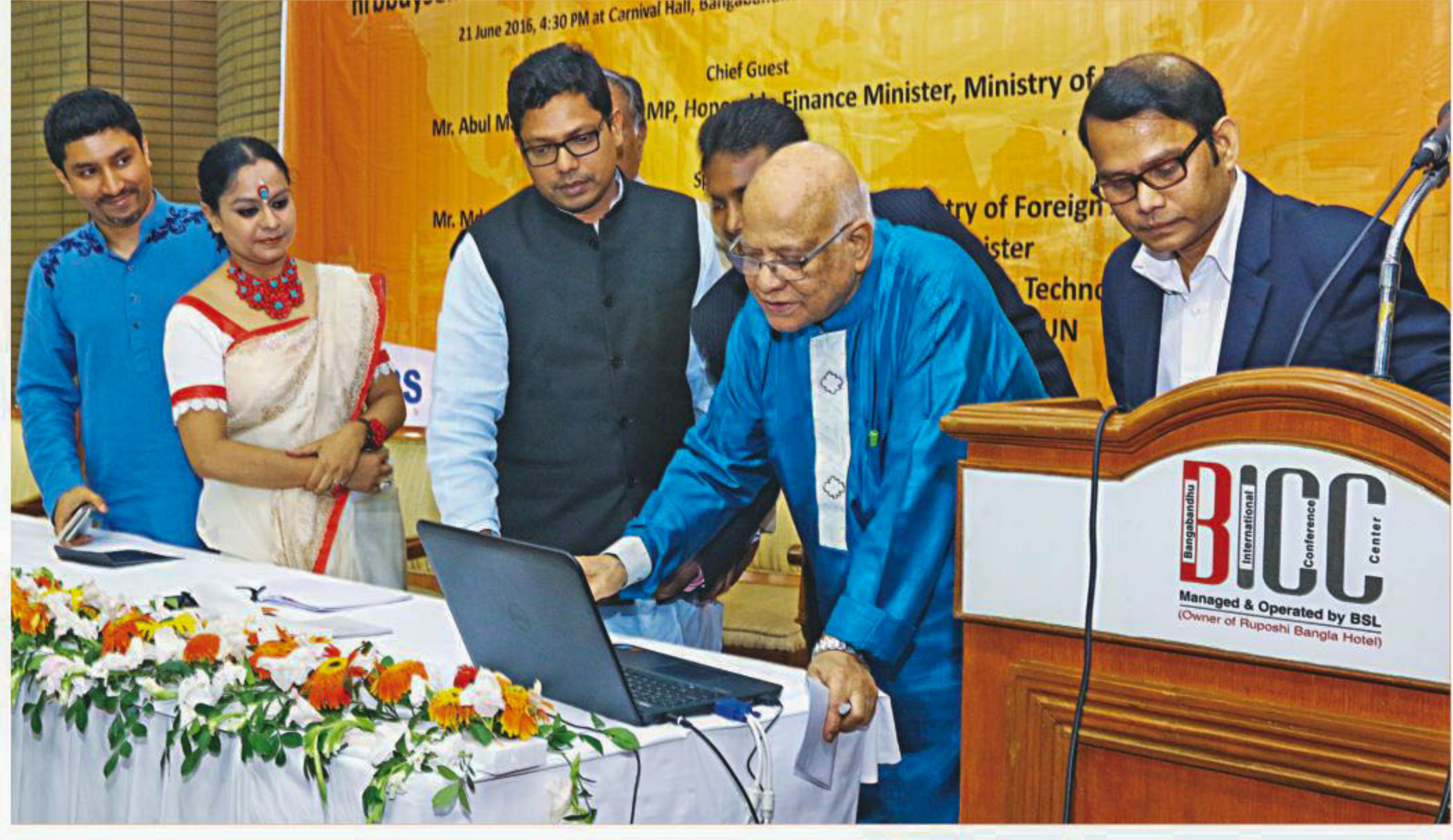
AMA Muhith, finance minister, launches nrbbuysell.com, an e-commerce site, at Bangabandhu International Conference Centre in Dhaka yesterday. Zunaid Ahmed Palak, state minister for ICT, was also present.