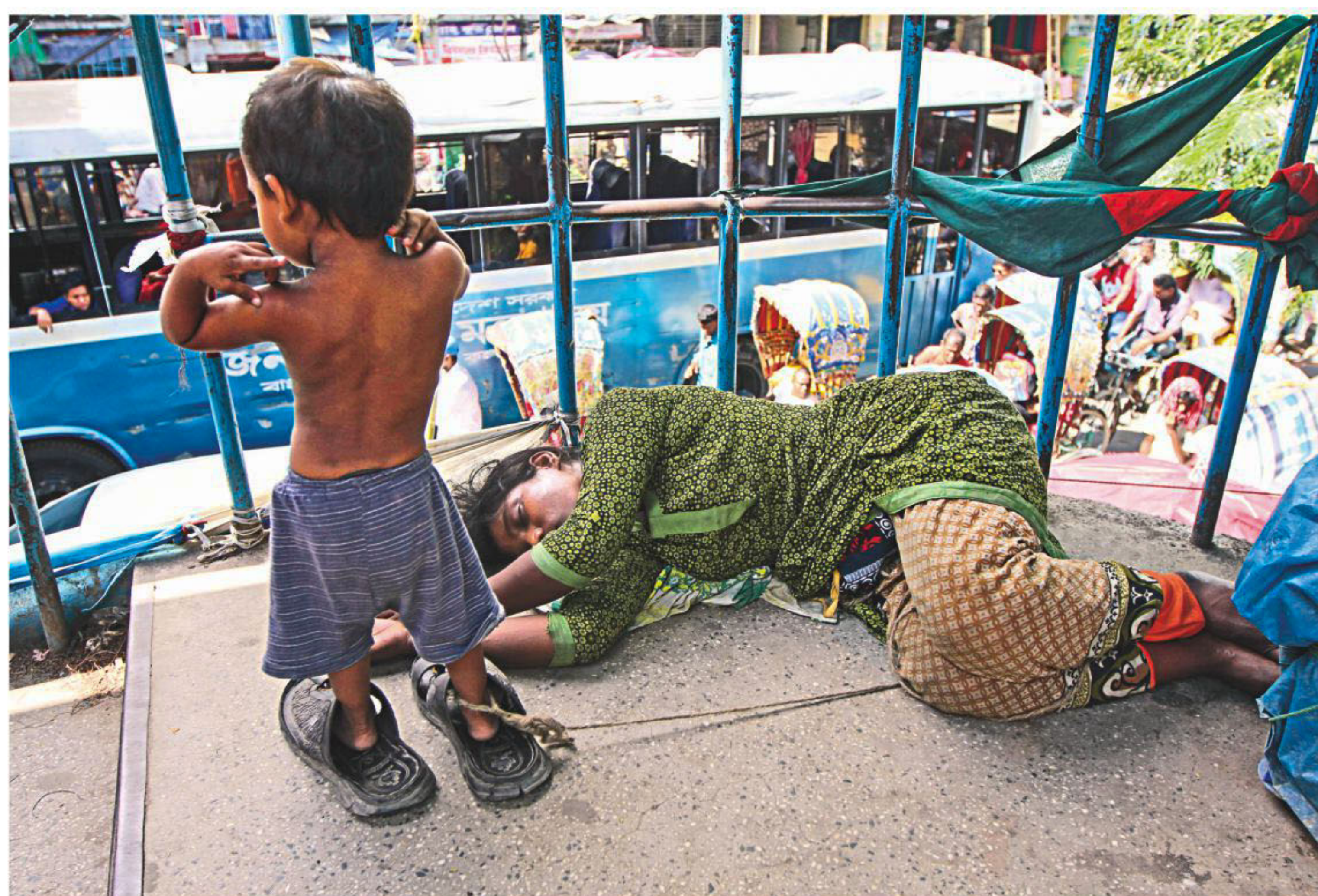
A homeless mother ties her child's foot to herself on a footbridge in Baitul Mukarram Mosque area so that she does not lose the child whilst taking a nap. The child however could easily fall through the iron bars of the bridge. The photo was taken on Monday.