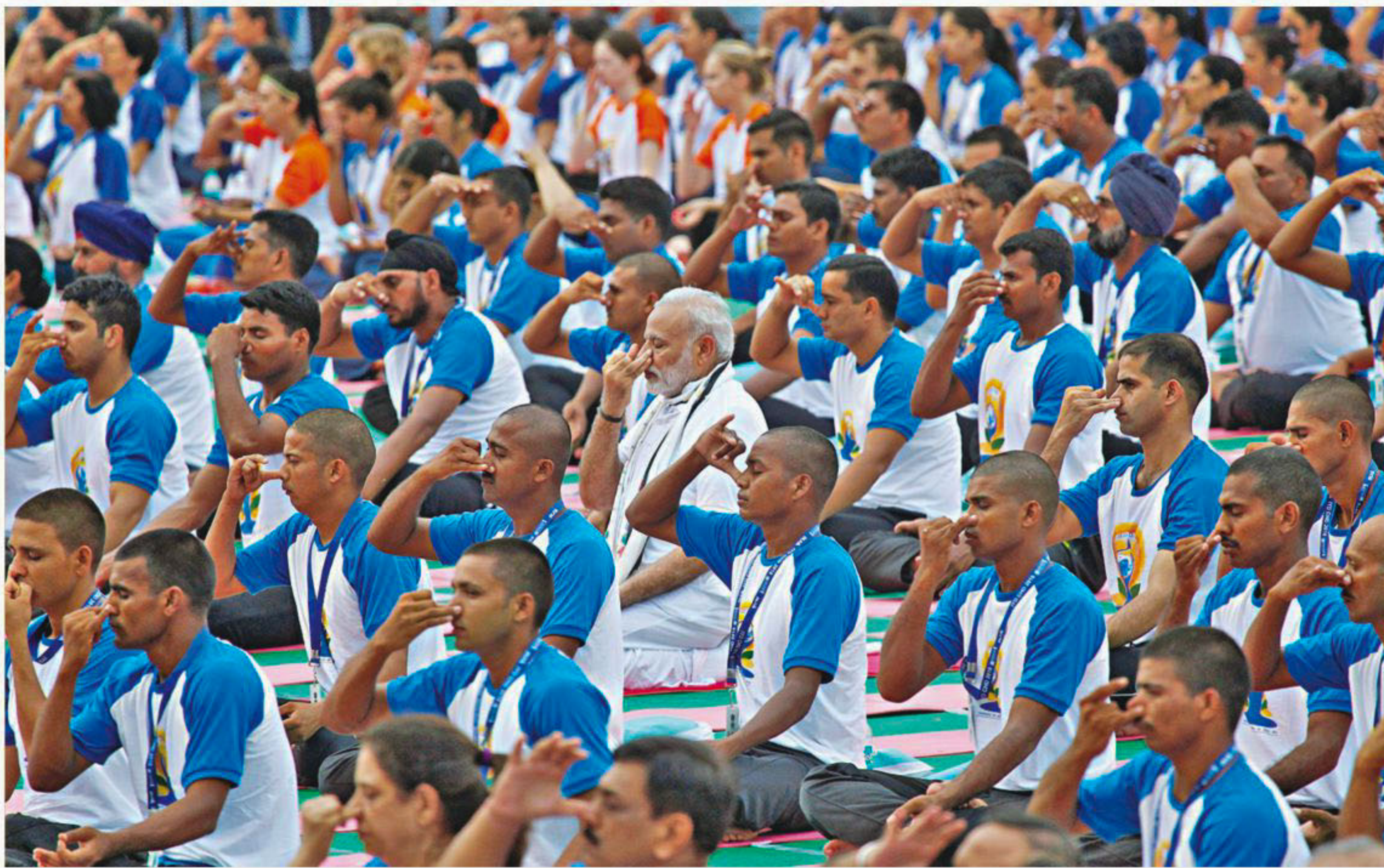
India's Prime Minister Narendra Modi performs yoga during World Yoga Day in Chandigarh, India, yesterday. Modi described yoga as a "people's mass movement" as he took to the mat yesterday along with millions of others in India and overseas to celebrate the ancient practice.

The Senate voted on similar measures in the wake of the December 2012 Connecticut school massacre and the San