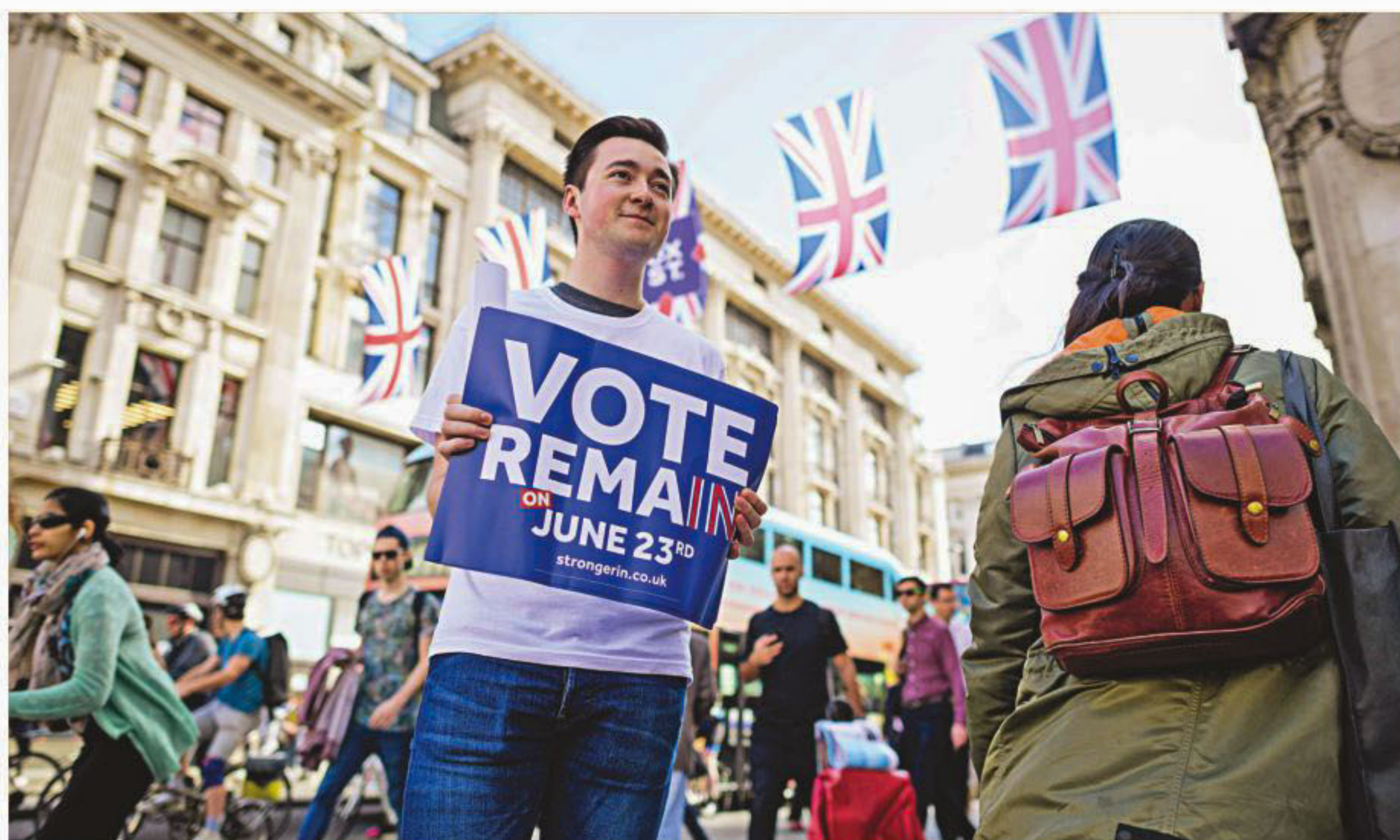
Campaigners from the "Vote Remain" group hand out stickers, flyers and posters in Oxford Circus, central London, yesterday. With two days to go until Britain goes to the polls in a Brexit referendum, the result remains too close to call.

They unleashed a five-month campaign of terror aimed at squashing any resistance to Patasse's rule. Prosecutors had called for a sentence of at least 25 years at the end of Bemba's lengthy trial which opened in November 2010.