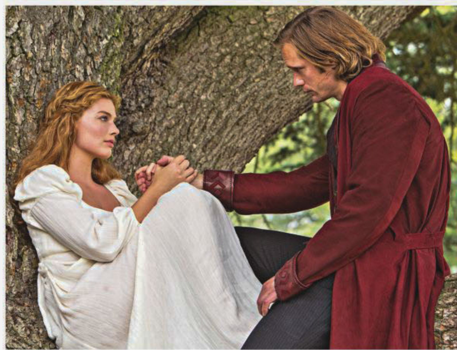
Alexander Skarsgård and Margot Robbie play Tarzan and Jane.