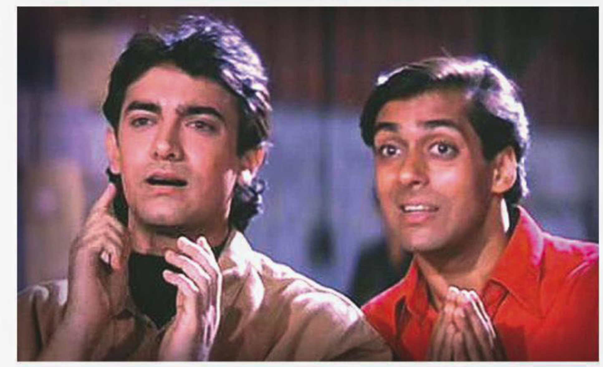
Aamir and Salman in the original "Andaz Apna Apna".