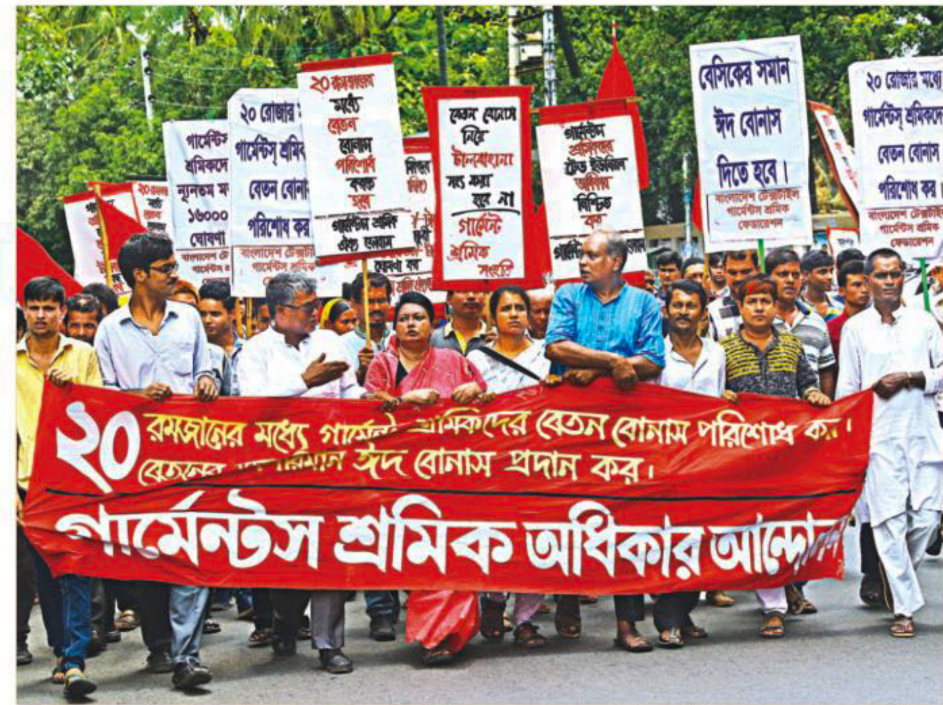
Garments Sramik Odhikar Andolon brings out a procession in front of the capital's Jatiya Press Club yesterday, demanding that RMG workers be paid their salaries and Eid bonuses by the 20th Ramadan.