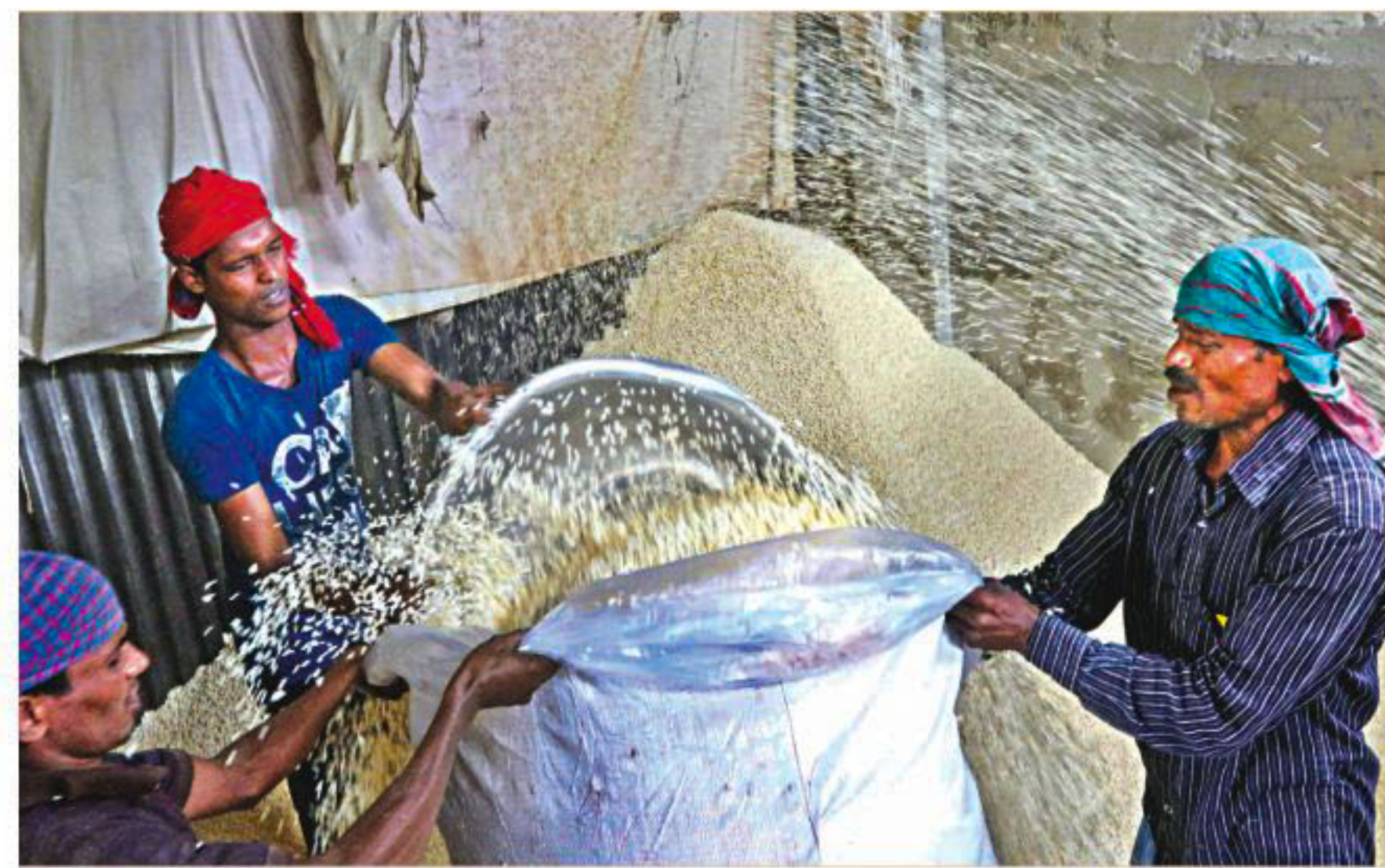
Without the hot spicy taste of the muri (puffed rice) mixture, the iftar menu is incomplete in most households of Bangladesh in Ramadan. Over the time, its consumption, hence demand, has increased so much that muri factories have grown up in many places in the country like this one in Narayanganj's Pagla Dhapa area, which produces around 2.5 tonnes of muri a day. The factory sells it for Tk 45 per kg, while it is Tk 60 at retail markets. Factory workers say muri production increases 20 times during the fasting month, and special rice varieties like Salki and Shishumoti are brought from Natore and Thakurgaon for this. The photos were taken last week.