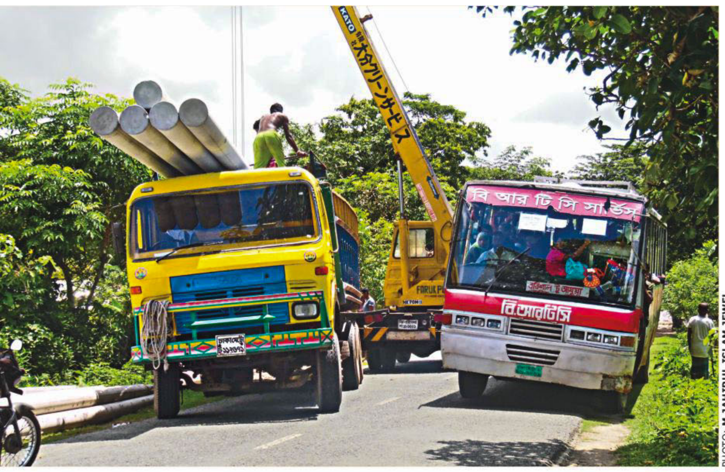
A truck unloads electric polls blocking one side of the Barisal-Khulna Highway with the help of a crane truck, while a bus drives carefully to avoid collision in Protap area of Jhalakathi yesterday morning. This blatant disregard for the safety of others not only hampers smooth traffic movement, but also can cause fatal accidents on this busy road.