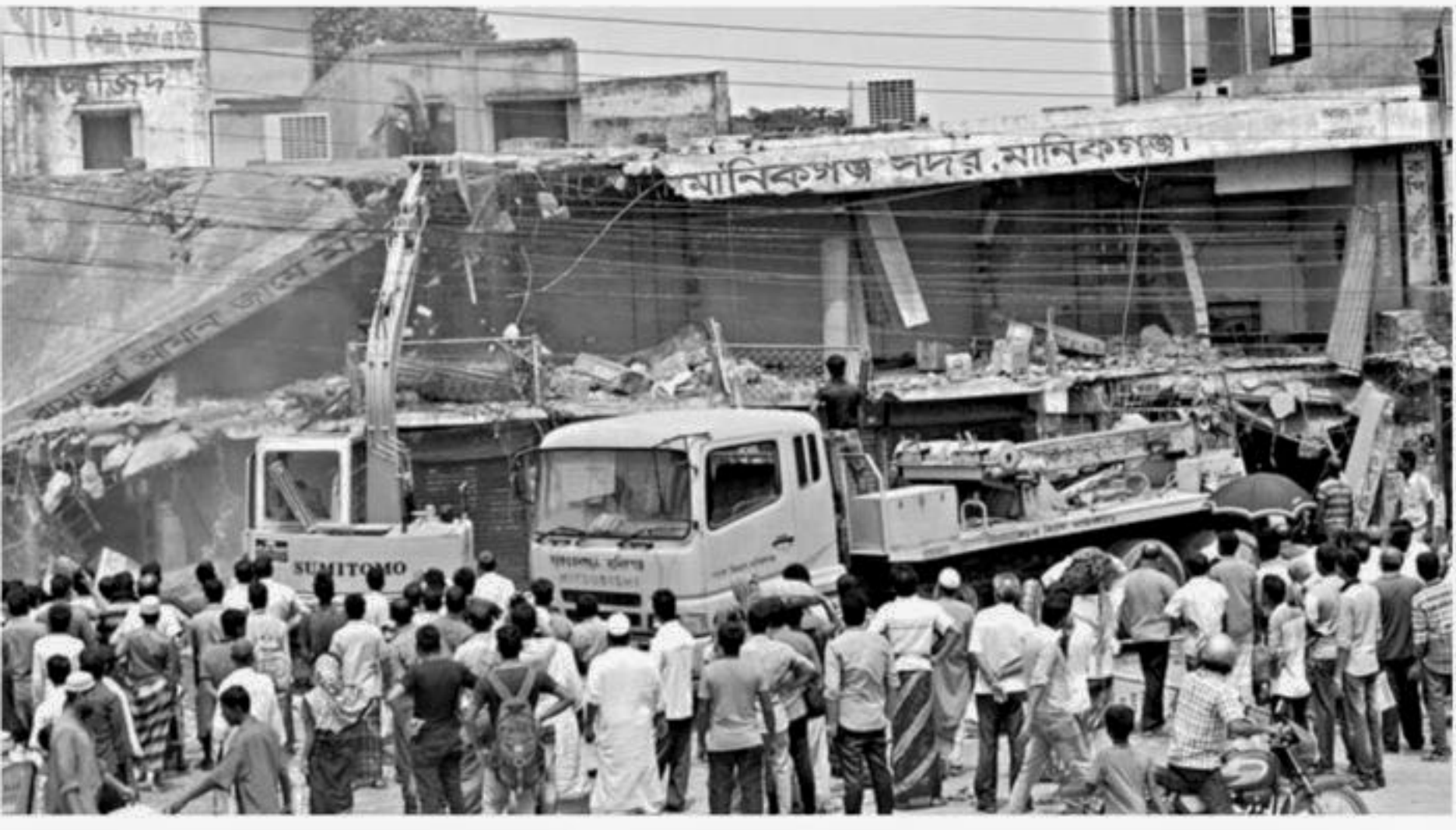
The Roads and Highways Department with the help of local administration demolishes 52 illegally constructed shops in Manikganj bus stand area yesterday.