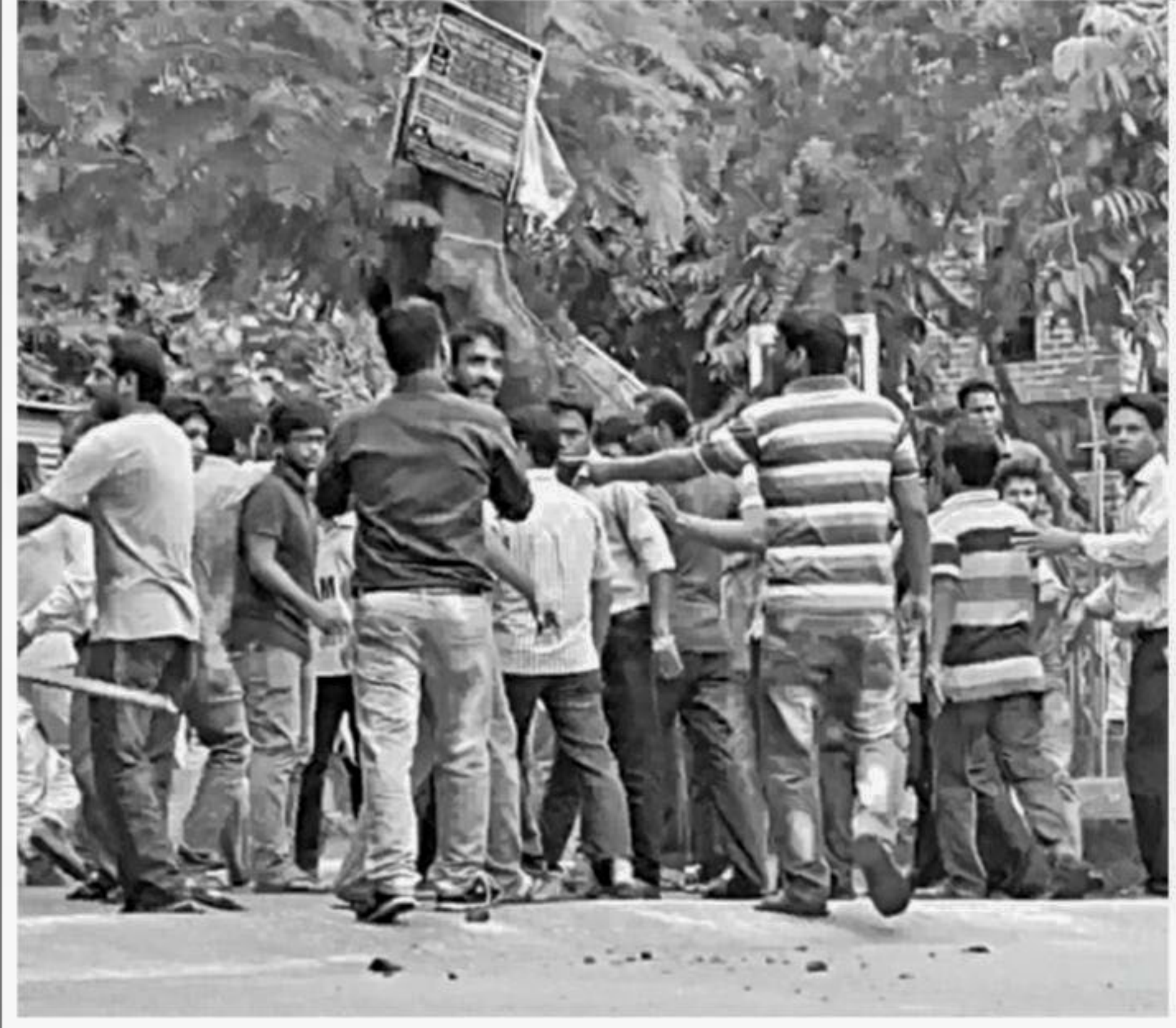
Aggrieved due to death of a fellow under the wheels of a university bus on the campus, students of Hajee Mohammad Danesh Science and Technology University in Dinajpur went on the rampage there.