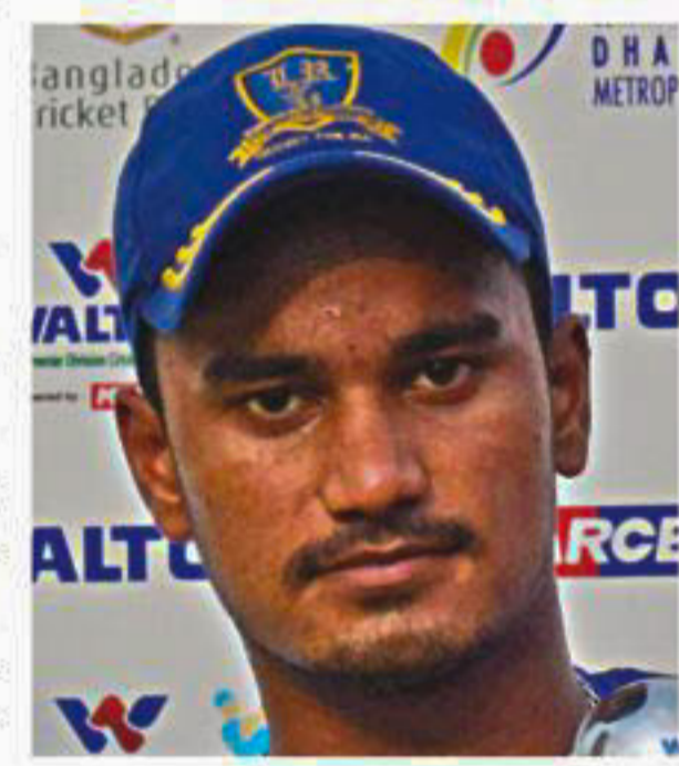
NEGI ... 124 not out