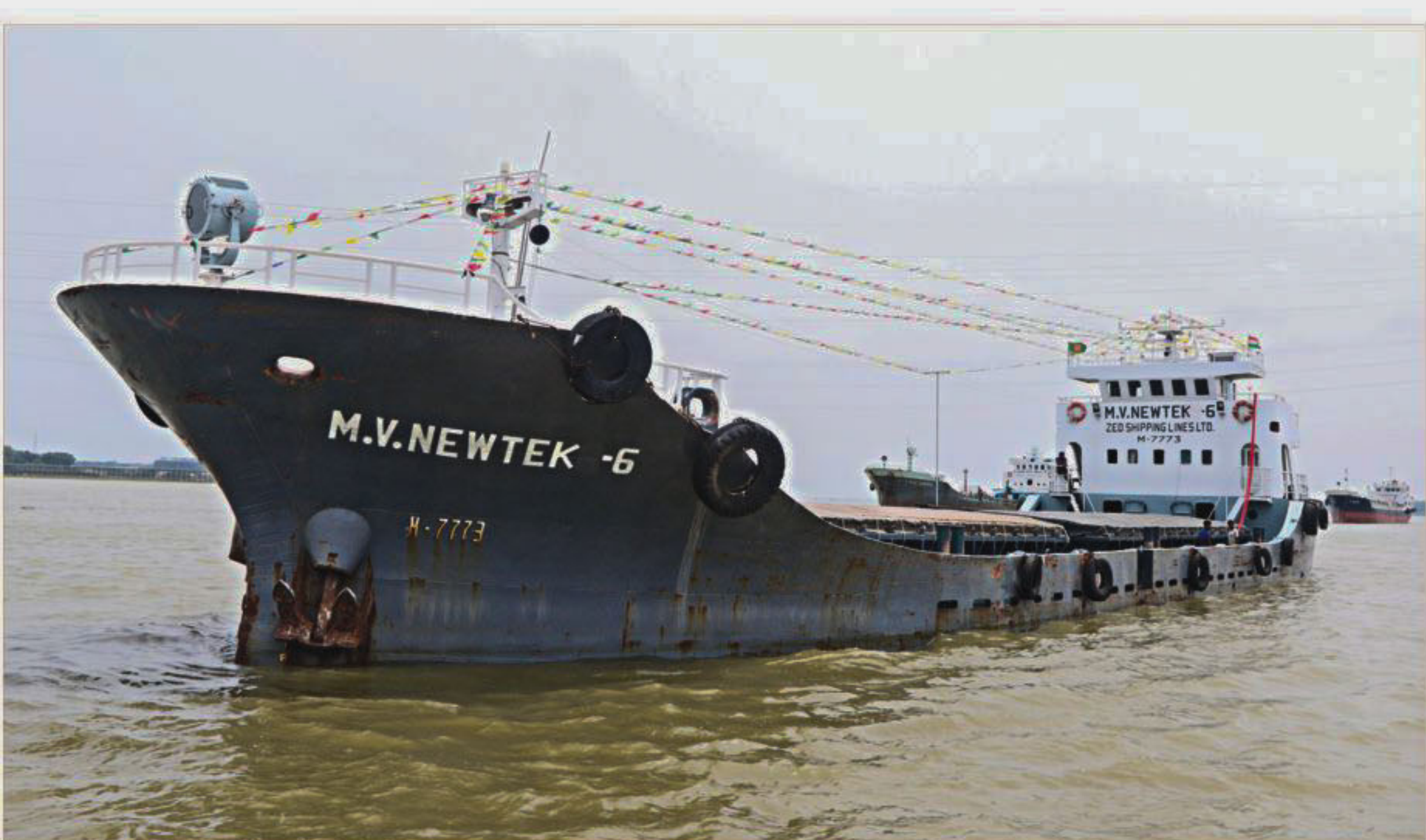
A Bangladeshi vessel carrying Indian goods and with the Bangladesh and Indian flags flying reaches Ashuganj of Brahmanbaria. The photo was taken on the Meghna yesterday.