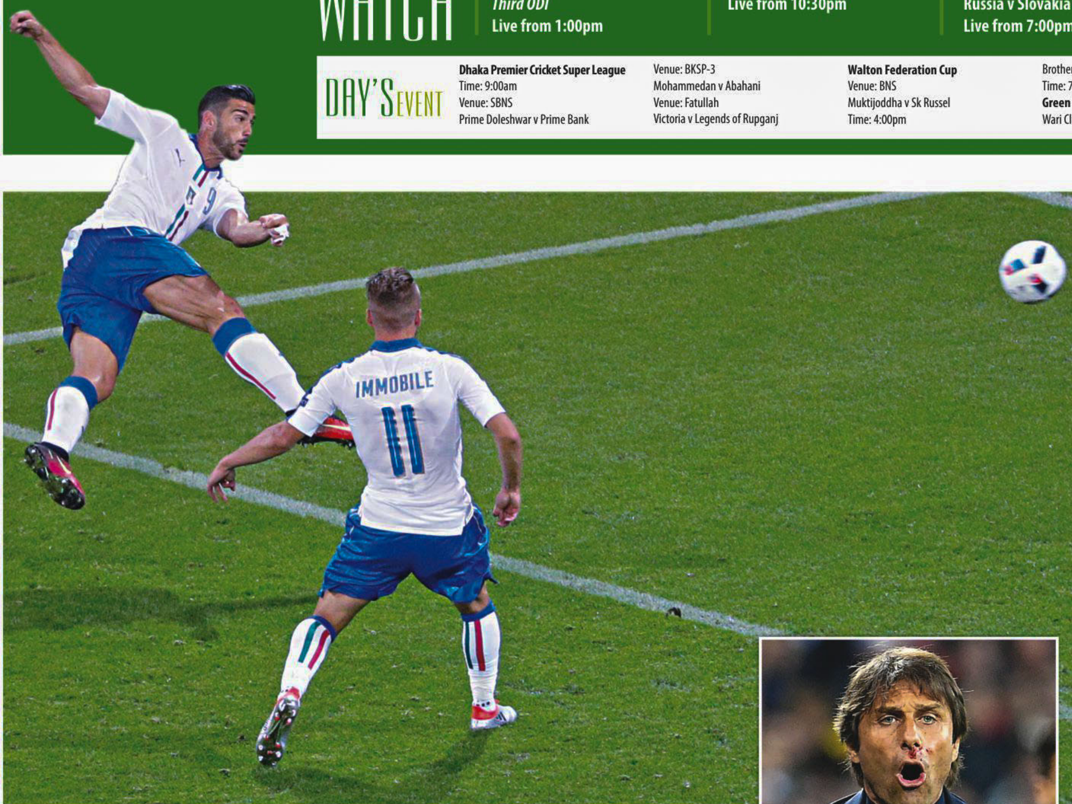
Italy striker Graziano Pelle scored a wonderful acrobatic goal against Belgium to put their Euro 2016 Group E opener to bed at the Park Olympique Lyonnais on Sunday. (INSET) Earlier, Italy tactician Antonio Conte celebrated the opening goal from Emanuele Giaccherini with such fervour that he bumped heads and suffered a nosebleed.

Time: 2:00pm Mohammedan v Mariner Youngs Time: 4:00pm Venue: Maulana Bhasani Hockey Stadium