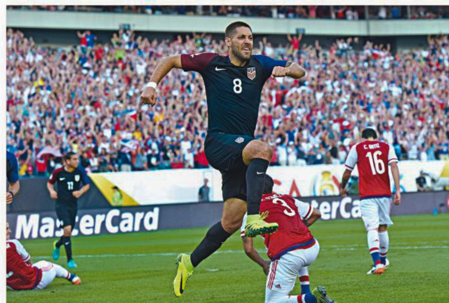
Clint Dempsey celebrates after scoring the decisive goal against Paraguay. The win took USA to the top of Group A, as Colombia crashed to second with a 3-2 defeat to Costa Rica.

Celso Borges then gave Costa Rica a two-goal cushion, rifling home a low finish from eight yards to put the 2014 World Cup quarter-finalists 3-1 up. Marlos Moreno pulled a goal back for Colombia but it was too little too late for Pekerman's side.