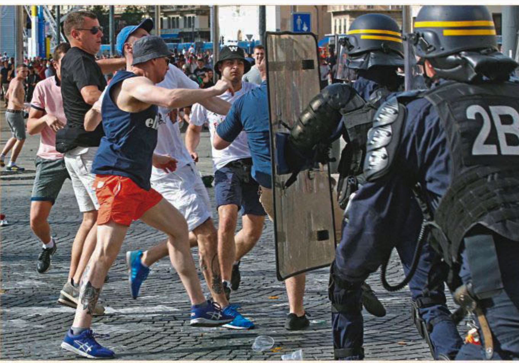
Supporters clash with police at the old port of Marseille before the match between England and Russia. There were numerous arrests made and both groups of supporters sustained injuries.

Argentina have already qualified for the quarter-finals.