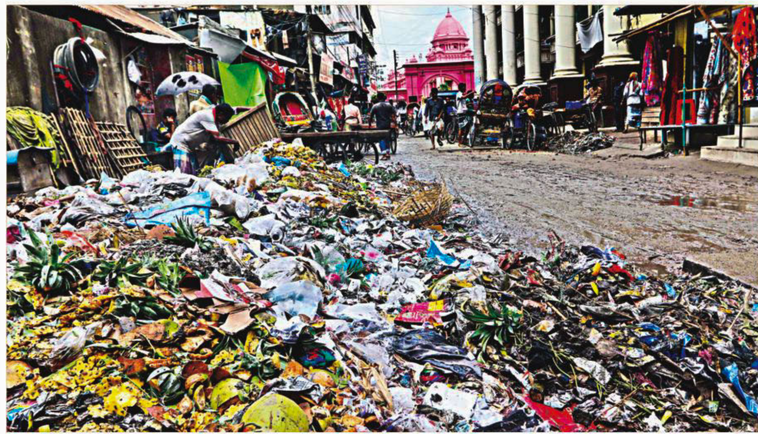
Apart from the overwhelming stench, this pile of garbage proves to be an eyesore just yards away from Ahsan Manzil, one of Dhaka's oldest historical sites attributed to promoting tourism with the lure of its Kumartuli premises on the banks of the Buriganga river. The photo was taken on June 9.