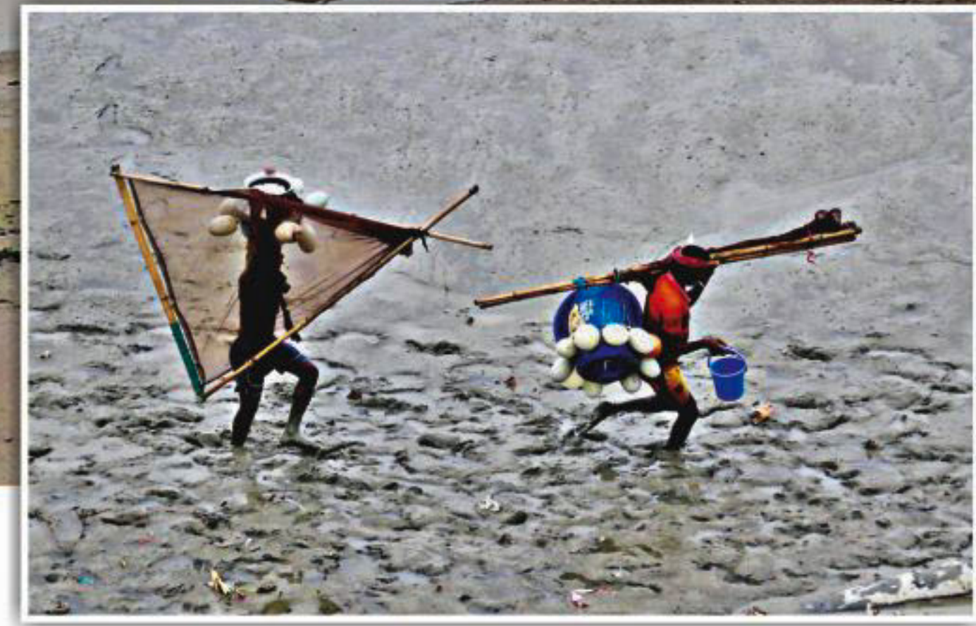
The dramatic change siltation can bring, especially when the tide begins to ebb, revealed by the mere ease with which these fishermen, inset, are walking over the bed of the Karnaphuli river, which is yet mighty enough at one point to power the Kaptai electric dam. The photo was taken on June 9.