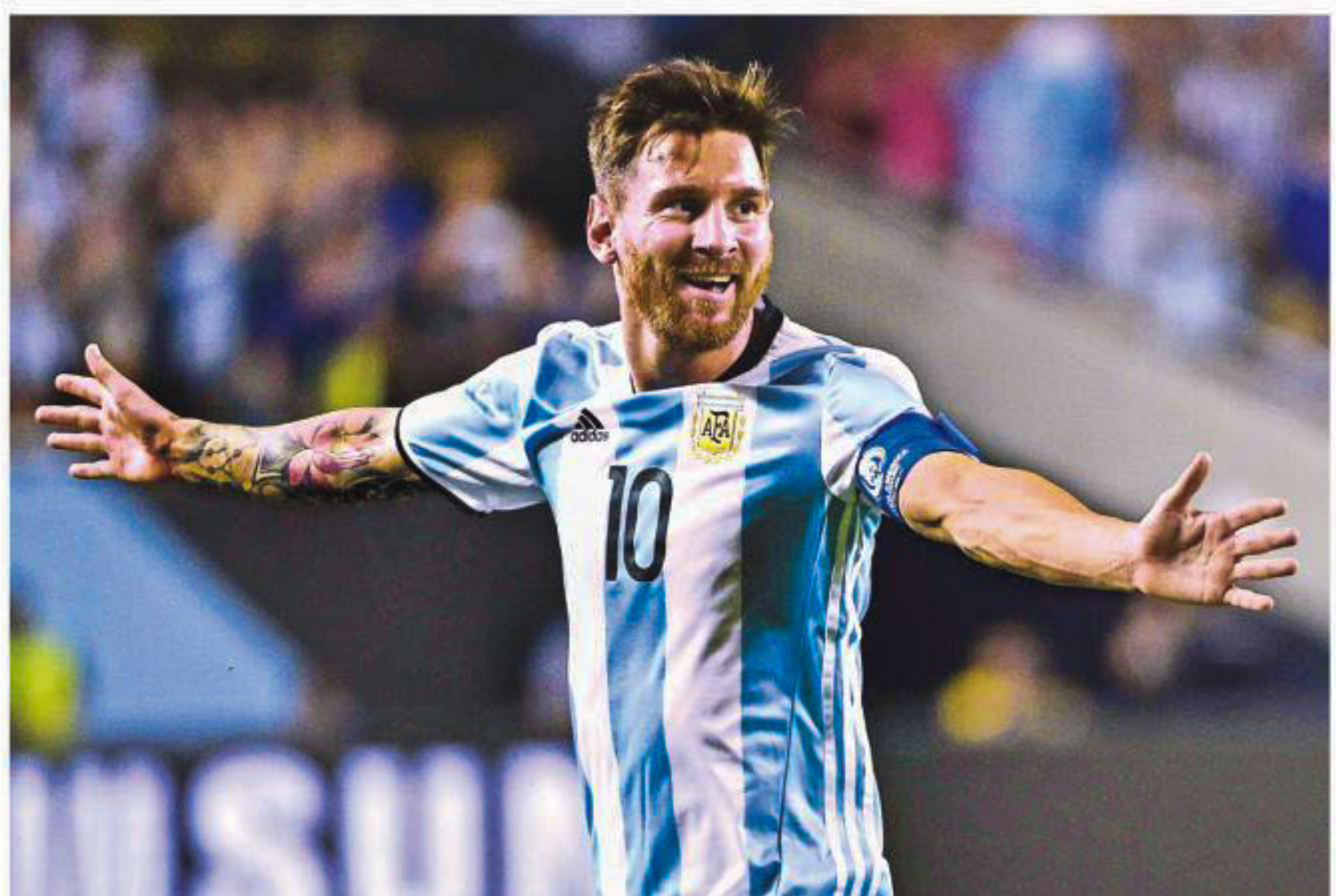
Argentina superstar Lionel Messi celebrates his second goal against Panama during their Copa America clash in Chicago yesterday.

However, German assistant boss Thomas Schneider insisted Schweinsteiger is fit and highlighted the importance of his leadership to such a young squad.