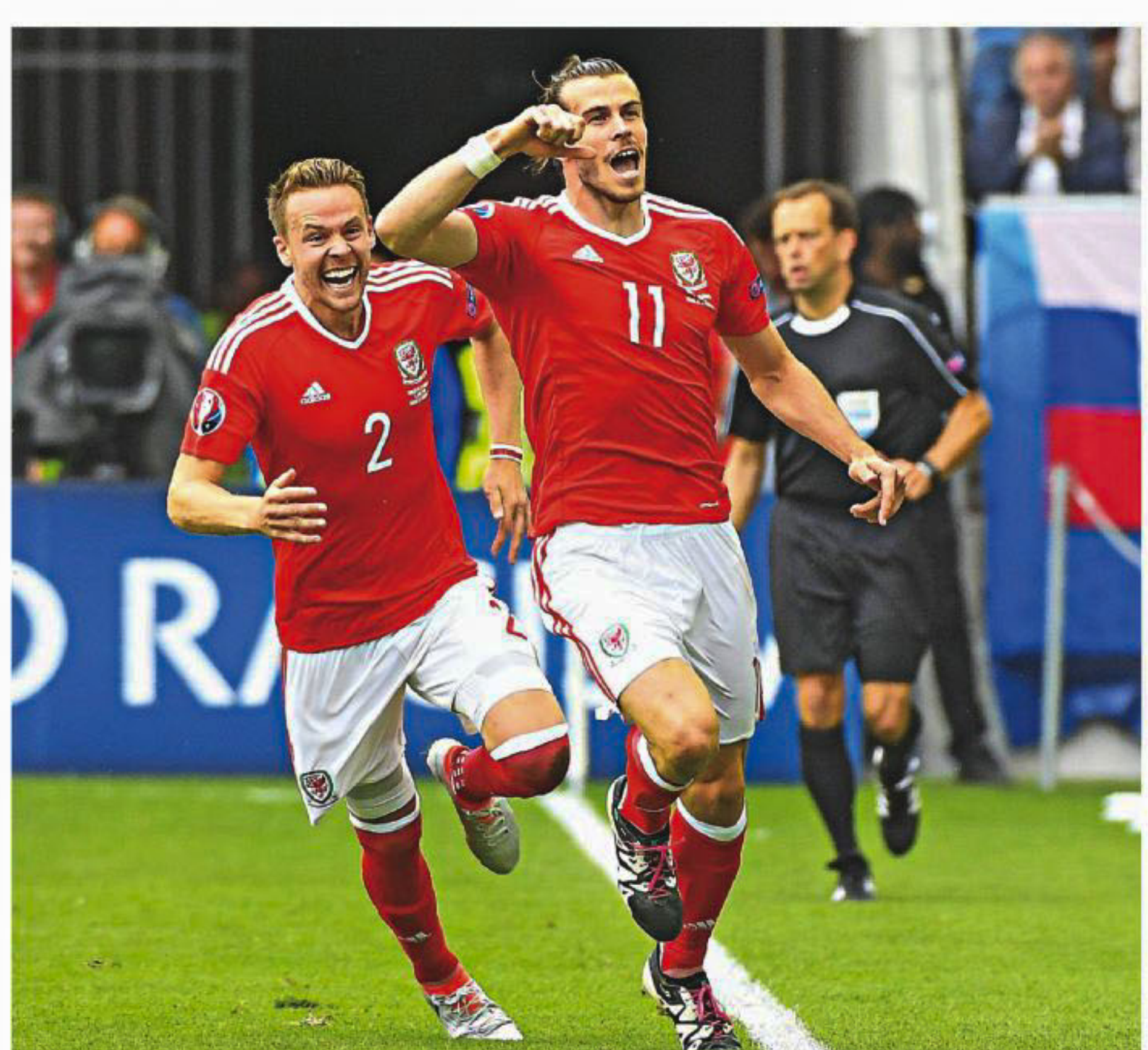
Wales star Gareth Bale (R) celebrates his opening goal against Slovakia during their Euro 2016 Group B match in Bordeaux yesterday.