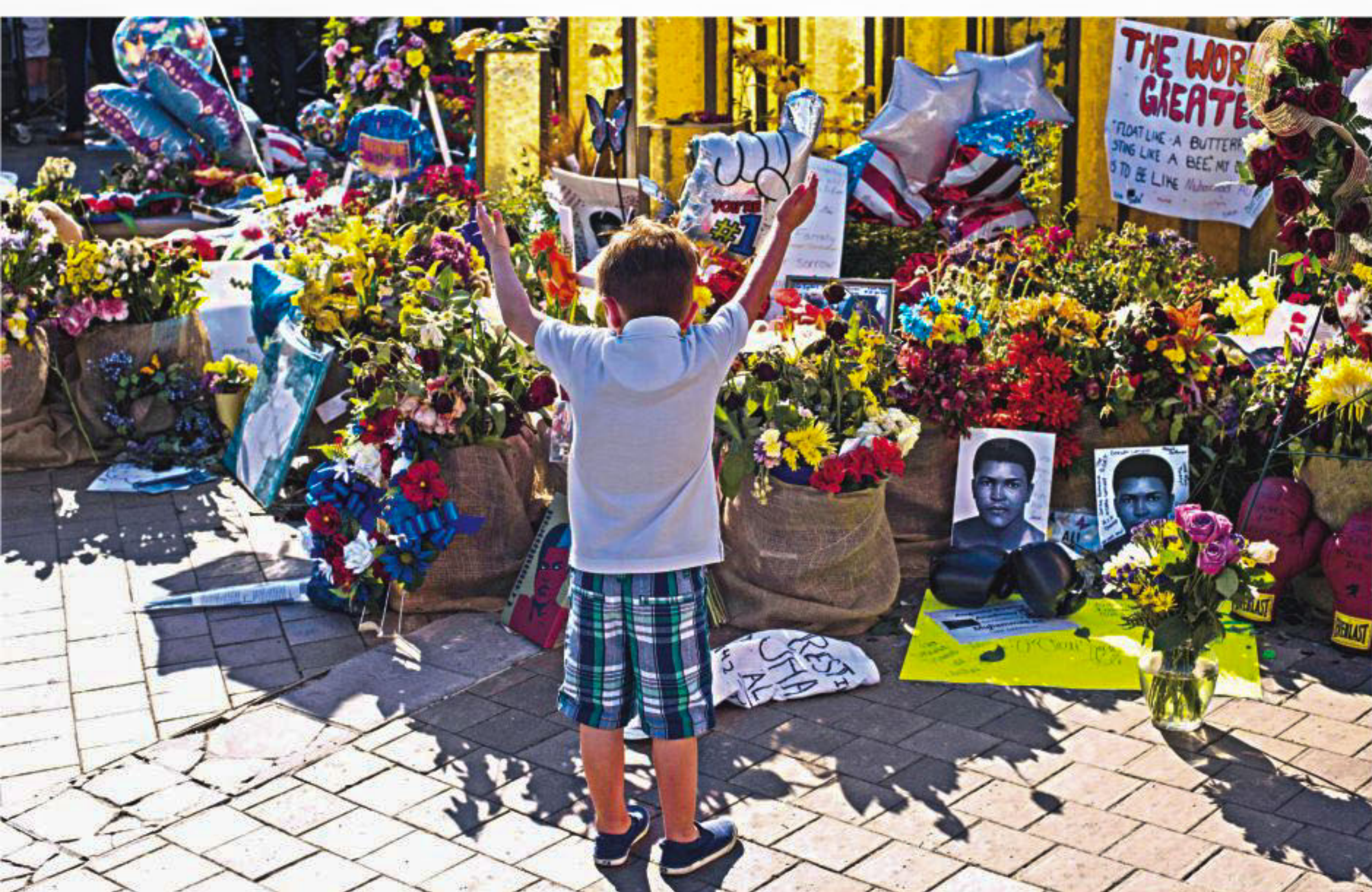
A boy raises his arms in the air in front of a memorial at the Muhammad Ali Centre in Louisville, Kentucky on Friday. After the funeral and the eulogy, people reconvened there to celebrate the life of the iconic sports figure.

Bangladesh SC v Railway SC Time: 4:00pm Venue: Maulana Bhasani Hockey Stadium