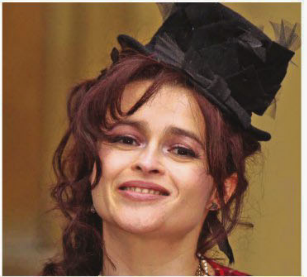
Helena Bonham Carter