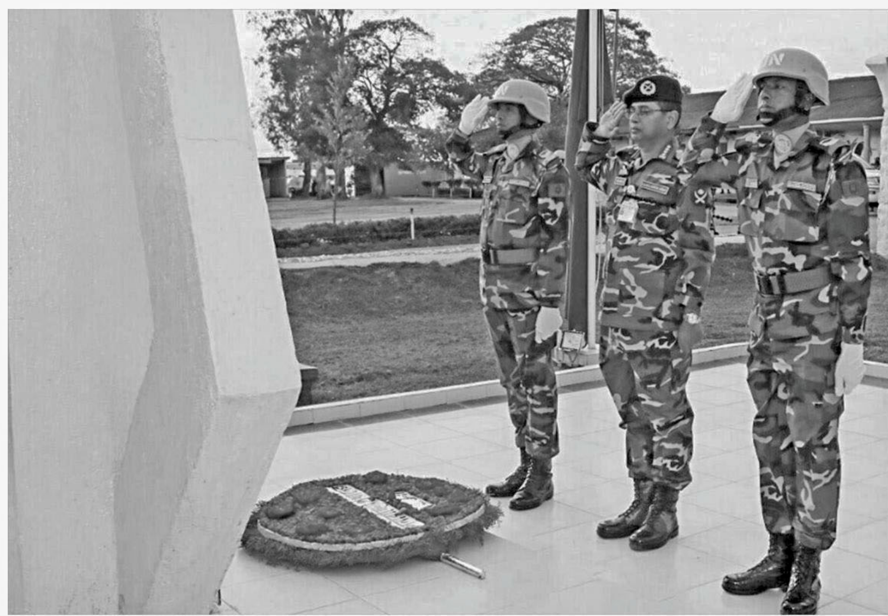
Army Chief Gen Abu Belal Muhammad Shafiu Huq saluting 13 Bangladeshi martyred peacekeepers at the Martyr Square in Ndromo army camp in Bunia of the Democratic Republic of Congo on Friday.

They are scheduled to return home on June 15.