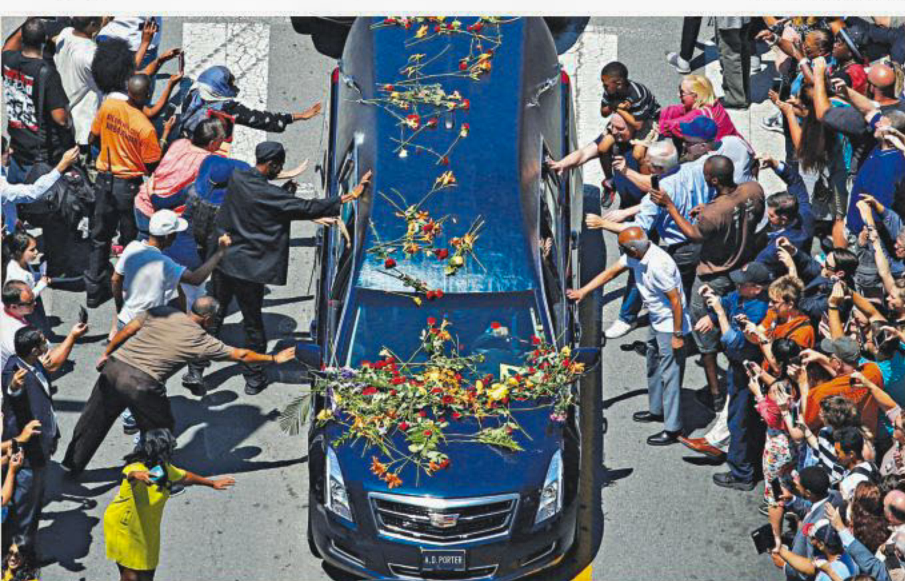
People touch the hearse carrying the body of boxing champion Muhammad Ali during his funeral procession through Louisville Kentucky on Friday.