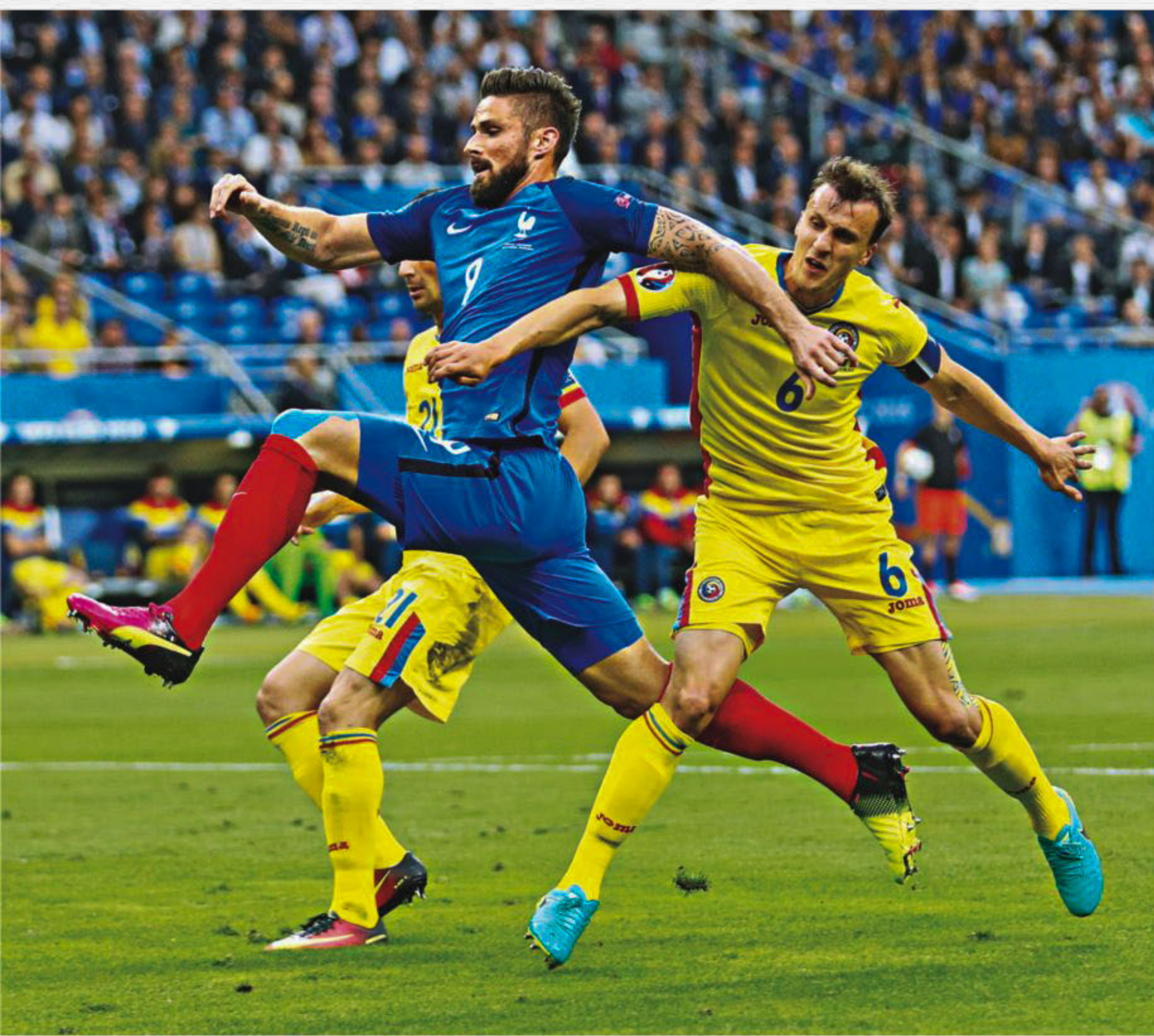
France's striker Olivier Giroud tries to hustle past a stubborn challenge from Romania's Vlad Chiriches in the early stages of their Euro 2016 opener at the Stade de France near Paris yesterday.

"If it is possible it gives me even more strength to be here with the national team," he said. "I have also had great support from my teammates and I am desperate to take part in this Euros. It is false what is coming out in the press and it will be in the hands of my lawyers."