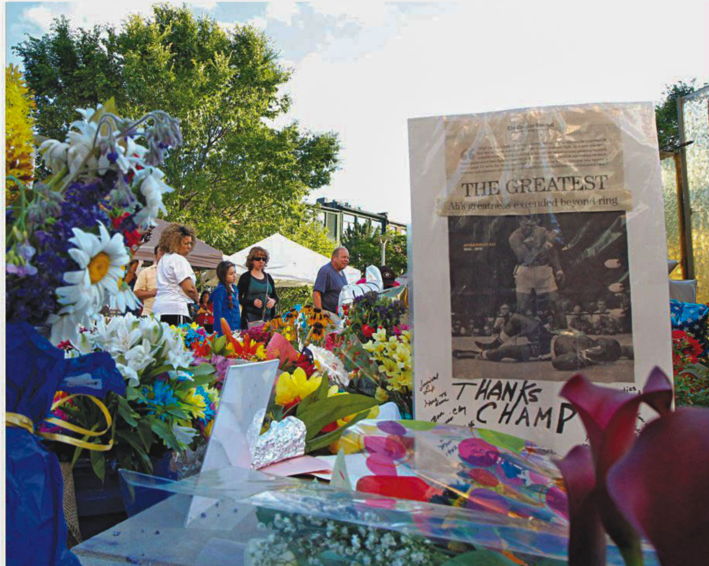
Fans of Muhammad Ali pay their respects as they view a makeshift memorial at the Muhammad Ali Centre in Louisville, Kentucky on Tuesday.

AUSTRALIA: 142 all out in 34.2 overs (Finch 72; Rabada 3-13, Tahir 2-39, Phangiso 2-26) Result: SA won by 47 runs.