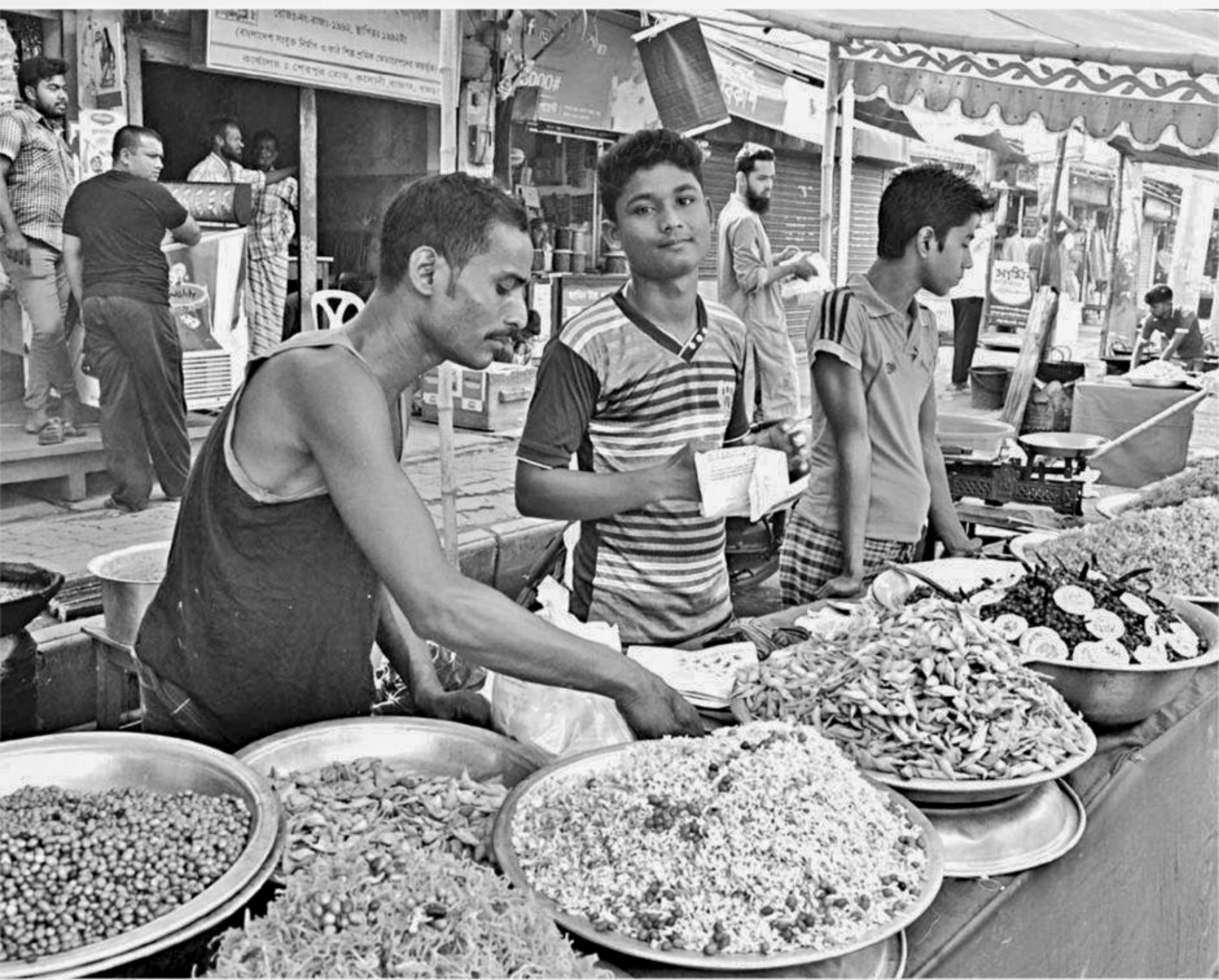
Gift items are on sale at Colony Bazar in Bogra town on the first day of Ramadan yesterday.