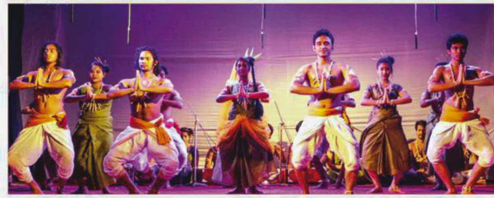
A scene from "Badol Borishone".