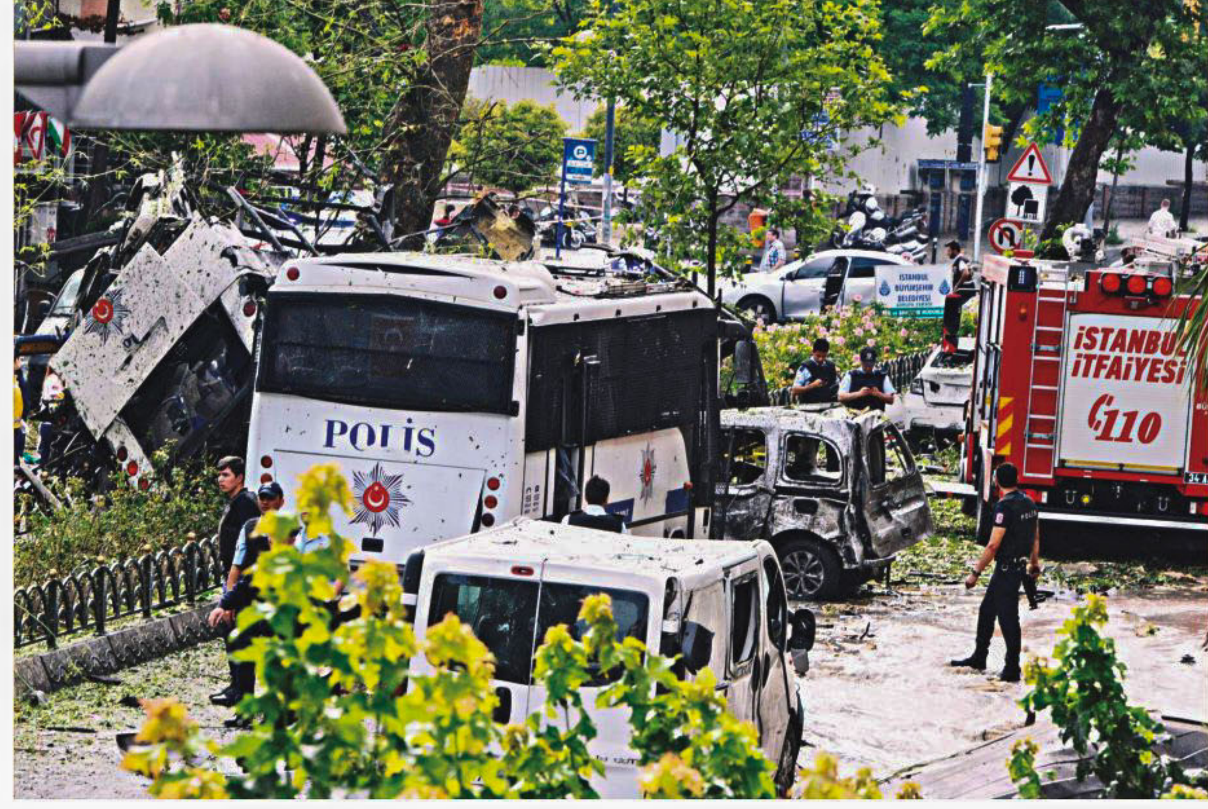
Police officers and rescuers inspect the site of a bomb attack that targeted a police bus in Vezneciler of Istanbul yesterday.