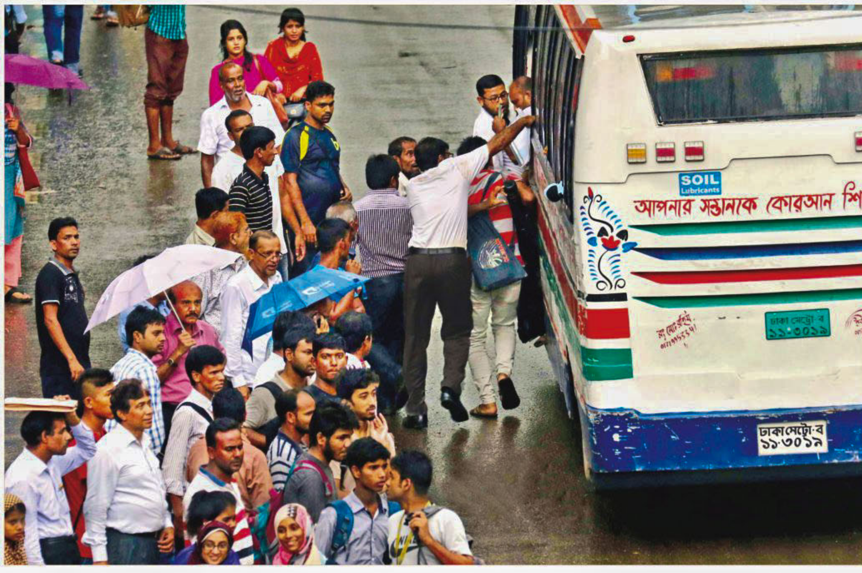
Passengers scramble to get on a crammed moving bus while others eagerly wait to avail the next one after work in the city's Farmgate area yesterday. Intermittent showers made their trips home difficult as they were keen to have the first iftar of the holy Ramadan with their near and dear ones.