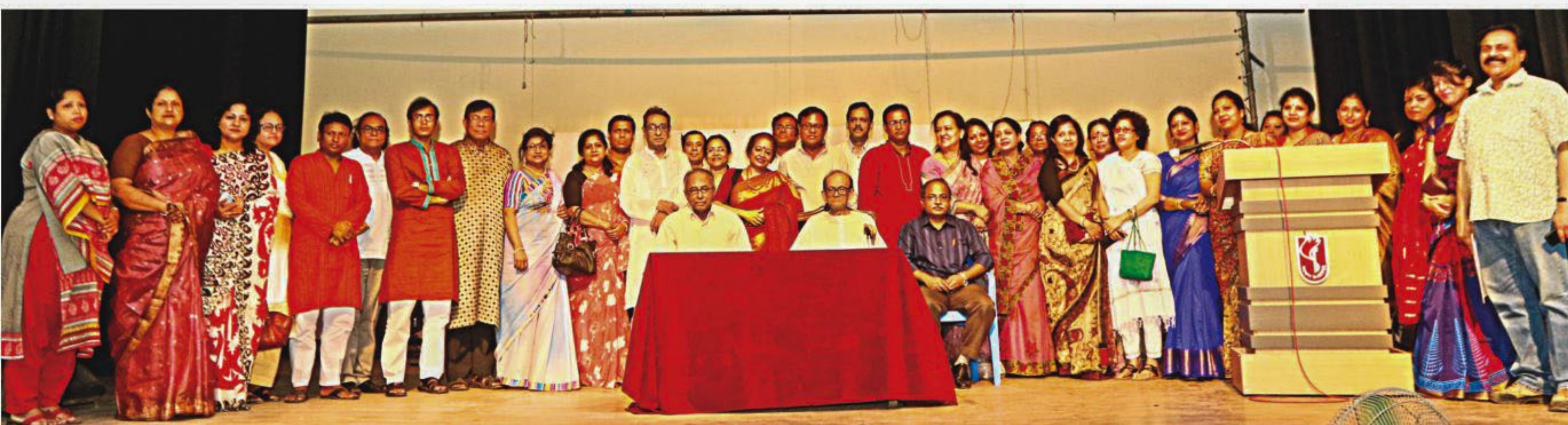
Artistes and guests at the album launch.