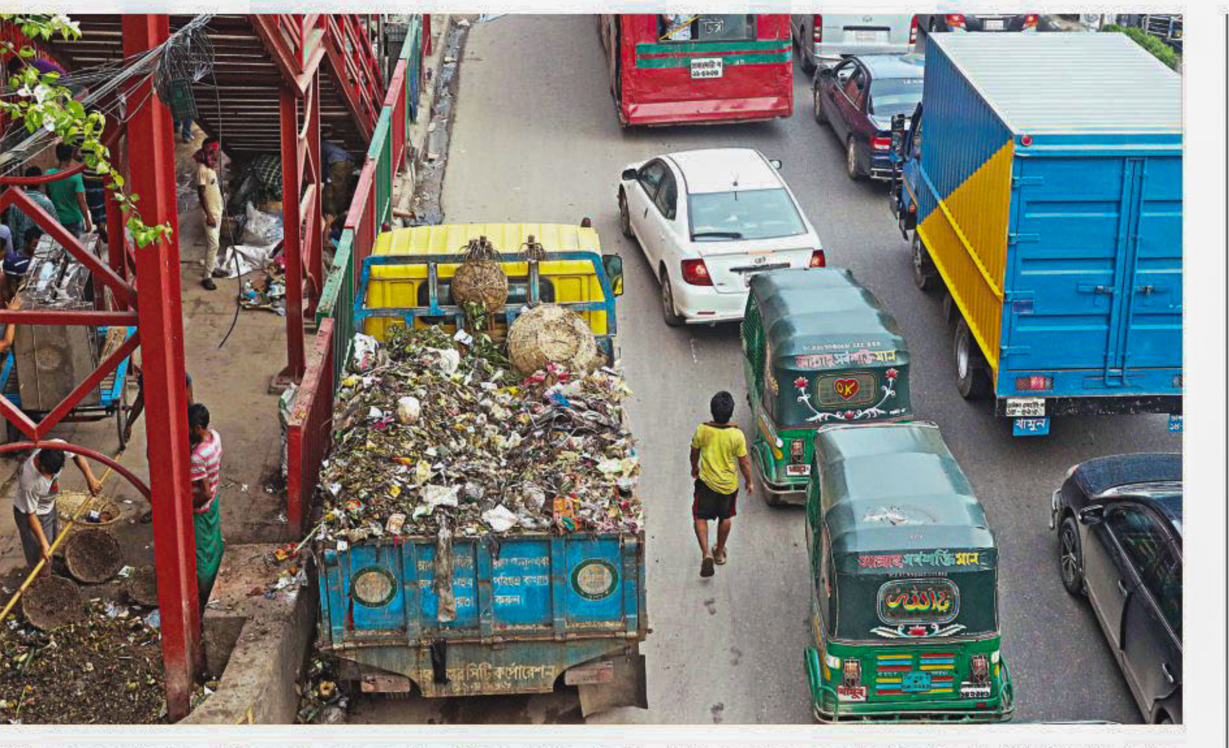
City corporation's garbage management workers gather trash while a garbage collection truck, filled to the brim, waits leisurely, in the capital's Farmgate area amid a long tailback. Daytime garbage collection has been declared banned by the corporations recently, a law that is much needed and appreciated, though remains futile until strictly implemented. The photo was taken yesterday at 5:45pm.