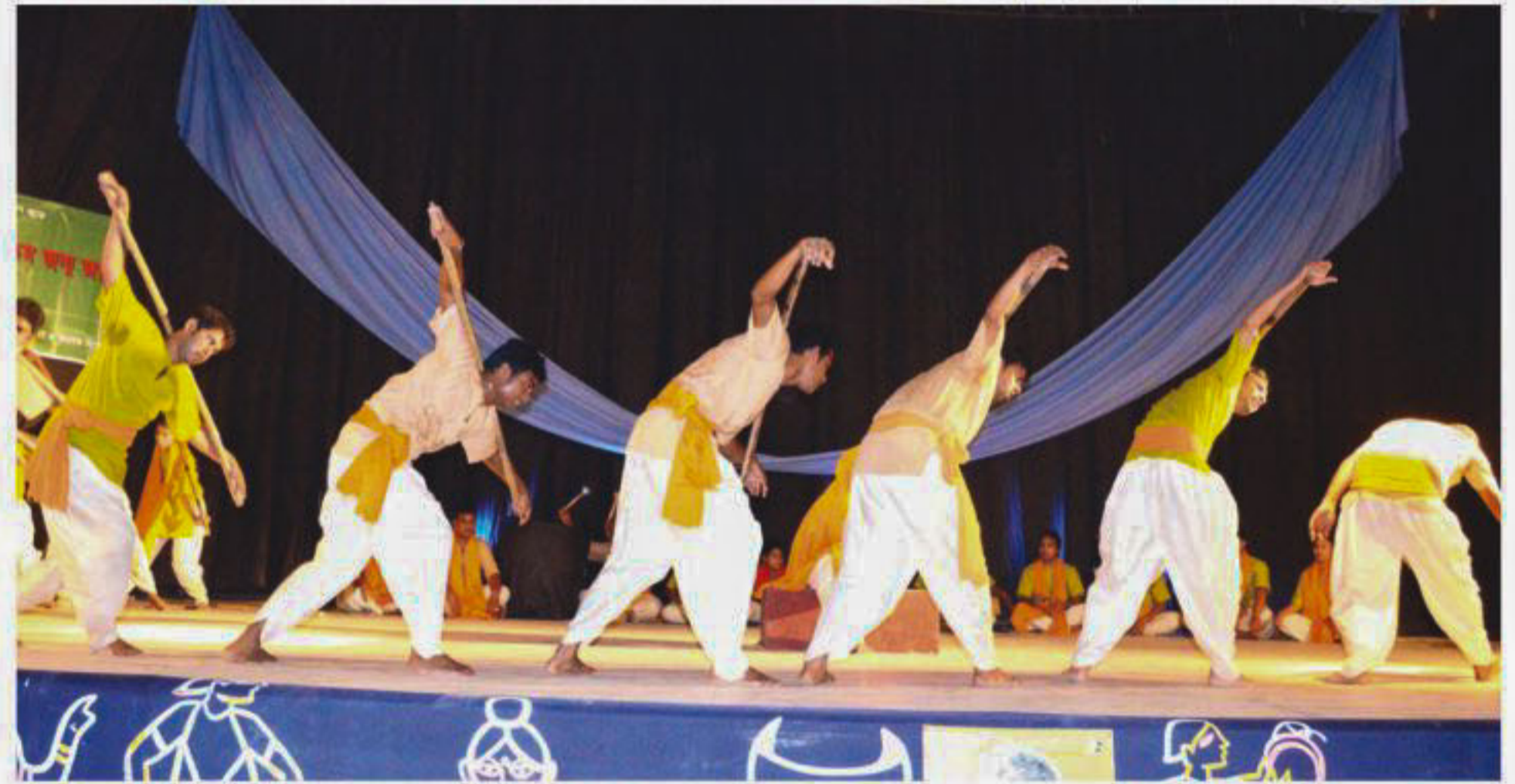
A scene from the play.