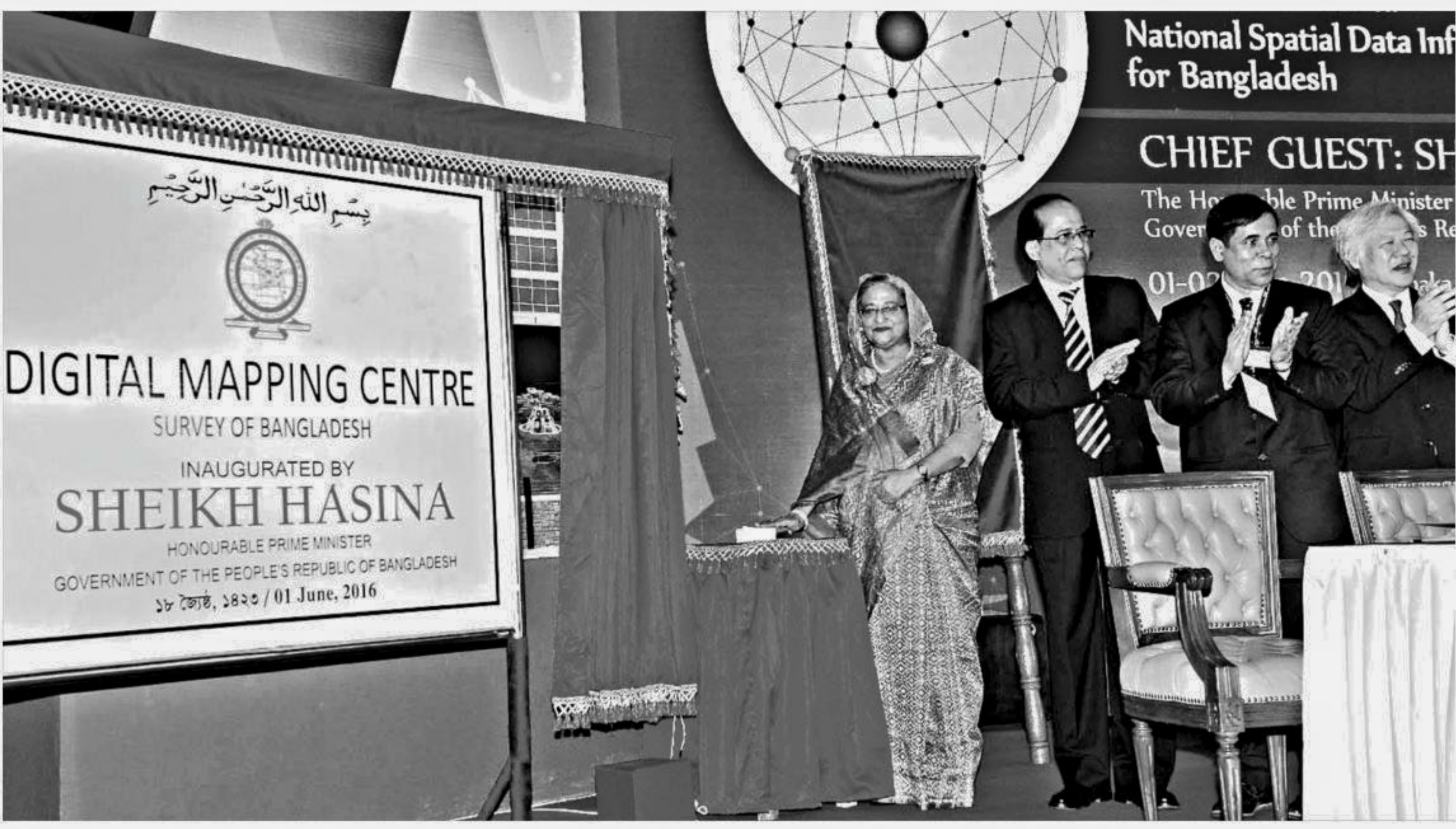
Prime Minister Sheikh Hasina inaugurates a "Digital Mapping Centre" in Damalcoat of Dhaka through video conference after launching at the Sonargaon hotel in the capital yesterday a two-day international seminar, "National Spatial Data Infrastructure for Bangladesh", jointly organised by the Survey of Bangladesh and Japan International Cooperation Agency.