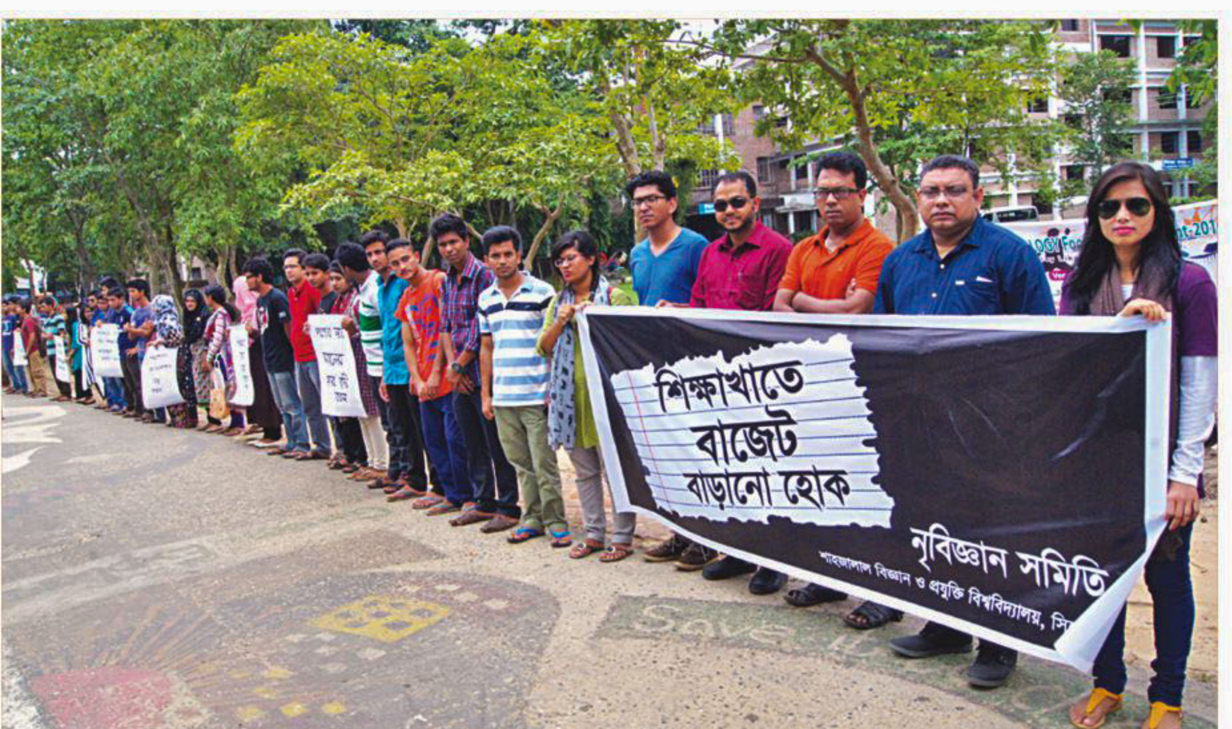
Teachers and students of Anthropology department of Shahjalal University of Science and Technology form a human chain on the campus premises yesterday demanding that the government increase budgetary allocation for education sector.

It estimated that a minimum of US $1.2 million is needed to ensure reproductive SEE PAGE 5 COL 5